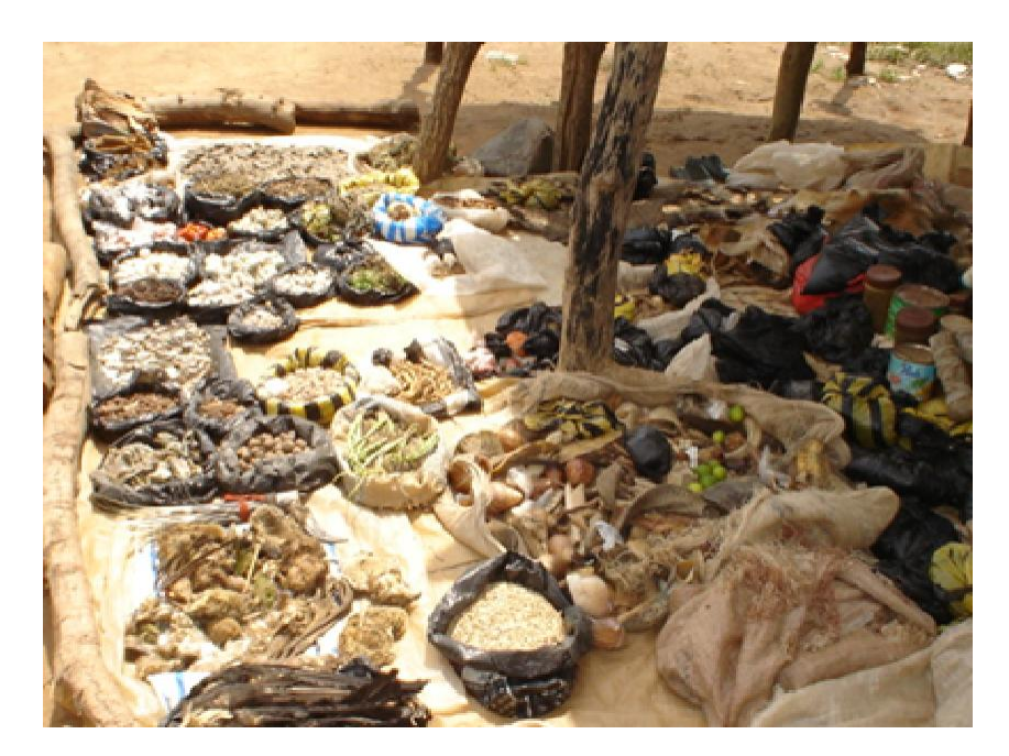
Figure 1. The wares of the Yan-shimfida spread at the market place.