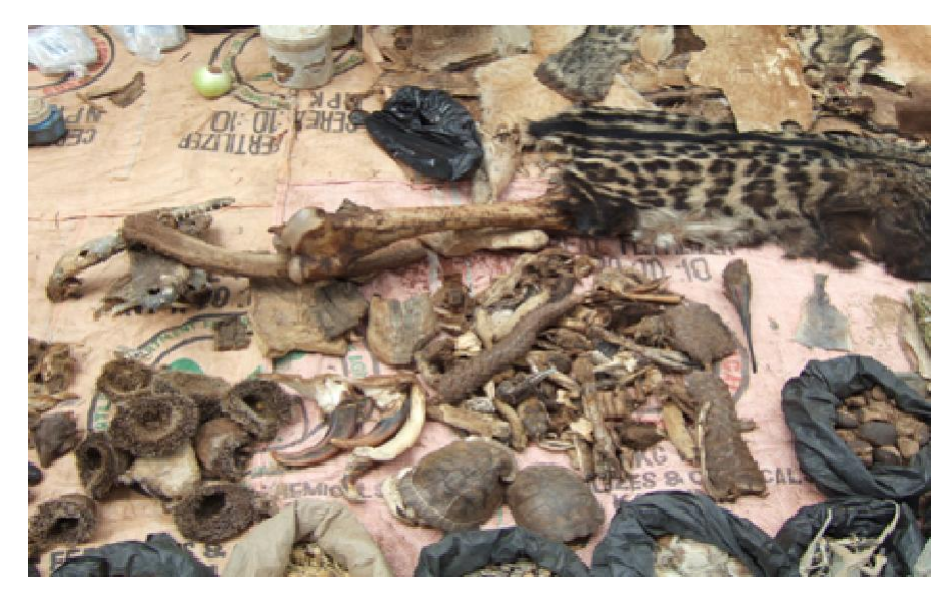
Figure 3. Different animal parts displayed at the market place by the Yan- shinfidas.

malaria, pile, stomach ache, dysentery, menstrual pain and spirit-related illnesses. Others were used as aphrodisiac, charm for erring wives and for protection purposes. Six animal fats were documented for use against different diseases (Table 3).