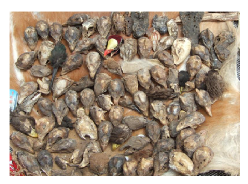
Figure 2. Heads of different animals displayed for sale by the Yan-Shimfida.