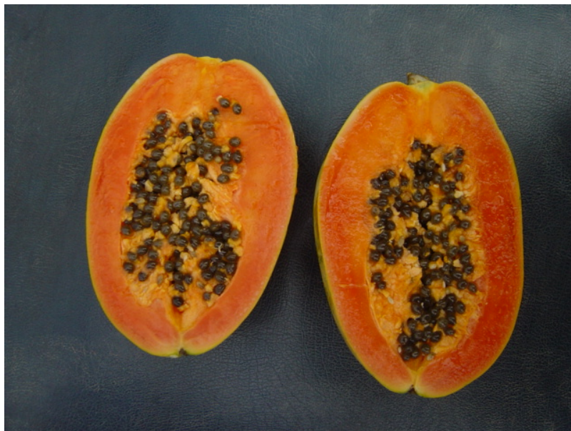
Eksotica variety