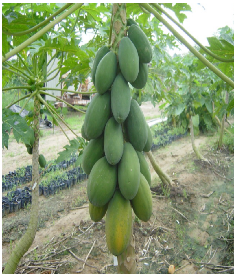
Ekstotica variety