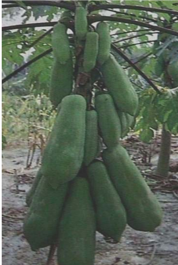
Foot Long variety