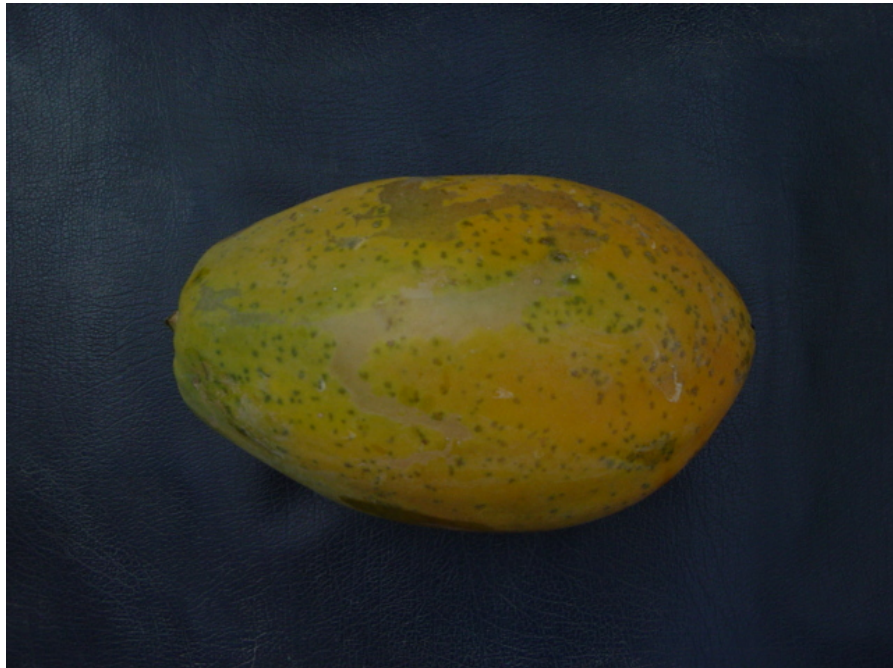
Eksotica variety