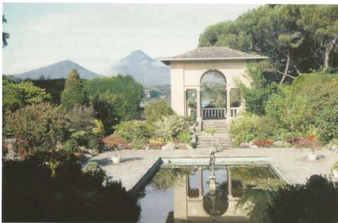
Innacullin, May 1998.

There are also some note-worthy photographs in the early issues - these are listed separately below. One 'Kodak Snapshot' is misleadingly entitled 'An