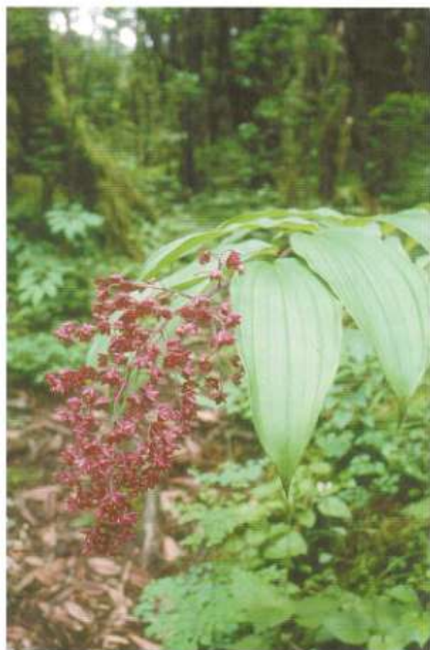
Maianthemum oleraceum var acuminatum

Undoubtedly the richest area for woodland plants in the Himalaya is the Royal Kingdom of Bhutan, which is largely due to the strict environmental policies of the Royal Bhutan Government, who have managed to maintain one of the highest forest coverages in the world, a very impressive 72.5%, in complete contrast to Nepal, where deforestation is still taking place at an alarming rate. Of necessity, woody plants have been completely omitted, as they would certainly warrant an article in their own right, as are most of the Himalayan woodland plants, which I consider are already well known, such as the classic Himalayan plant, Cardiocrinum giganteum .