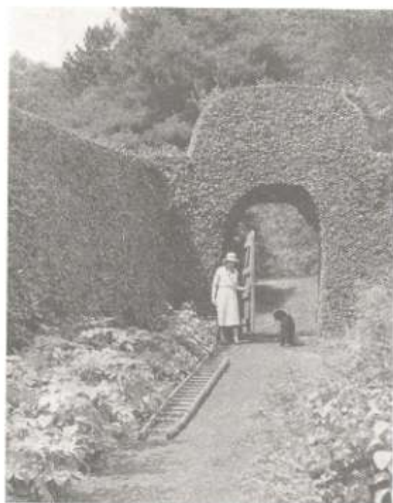
Tigrony, Co. Wicklow: 'The beech hedge that surrounds the garden'; with Miss Winifred Wynne; from My Garden October 1934.

each issue, and sometimes a few were interspersed with text towards the end. The monthly parts had separate title-pages listing the principal contents, and each volume had cumulative indexes.