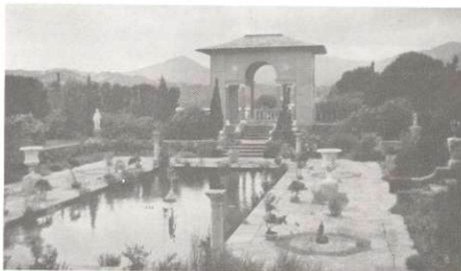
'An Italian garden'; a 'Kodak snapshot' from My Garden September 1937

M Y Garden was owned and edited by Theodore Alfred Stephens and was published in England continuously every month for 17 years. Initially the twelve parts were divided into three annual volumes (four parts per volume), but from volume 22 onwards, six parts formed a volume. The page size was small, 7 1/4 x 4 3/4 inches (bound volumes are trimmed to approximately 7 x 4 5/8 inches), while the relatively large type-size that was usually employed made it easy to read. To begin with, each part comprised 160 pages, but this was reduced especially during the Second World War when paper was scarce. There were advertisements at the front and the back of