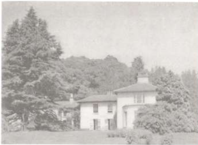
Tigroney, Co. Wicklow; from My Garden October 1934

Italian garden' - it shows the Italianate pool-garden on Innacullin (Garinish Island) at Glengarriff, Co. Cork. What makes it of unusual interest is the cluttering array of statuary, columns and vases which are around the pool; these are also seen in a photograph looking in the opposite direction that is reproduced in Malins and Bowe (1980). The My Garden image must date from the early- to mid-1930s, and shows the pond with clumps of rushes around the edge (Figures 1 & 2). The photographs accompanying Cecil Monson's articles provide glimpses of several significant gardens; the photographs of Winifred Wynne's garden at Tigroney (Figures 3 & 4), Co. Wicklow, are notable.