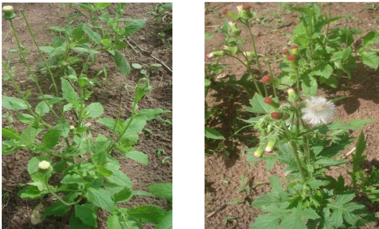
Figure 1: Flowering plants of vegetable Gbolo

Steroids are known for their analgesic, anti-microbial, anti-inflammatory and cardiotoxic properties [40]. They regulate carbohydrate and protein metabolism, increase muscles and bone synthesis and are also associated with hormonal control in women [40]. As reported by the local communities [11], vegetable Gbolo, when regularly taken, enhances lactation in newly born mothers. Therefore, one understands the reason why the leaves of Gbolo are locally used as vegetable for expectant and breast feeding mothers.