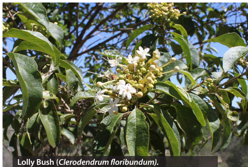
Lolly Bush ( Clerodendrum floribundum ).