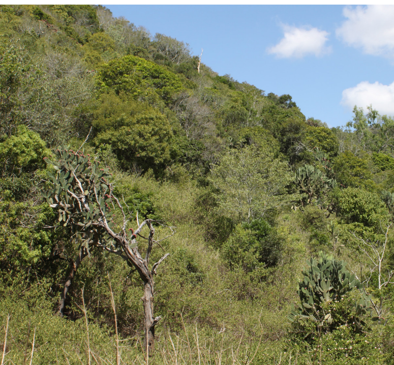
The weedy Prickly Pear or Tree Pear ( Opuntia sp. ) can infest the edges of semi evergreen vine thickets.

The introduced pasture grass Green Panic ( Megathyrsus maximus ) is a prolific seed regenerator which establishes in semi-shade along the margins of semi-evergreen vine thickets. It becomes highly flammable when dry and increases the risk of damage from fire. Fire normally burns to the edge of vine thicket patches under moist or cool conditions. However, under dry conditions fires will burn some distance into softwood scrub and can creep through the leaf litter on the forest floor. While some edge species will sucker, fire usually causes a great deal of stem death and damage. Fire also promotes weed invasion by Lantana, Green Panic, introduced members of the passionfruit family ( Passiflora spp. ) and other weedy grasses, vines and herbs. Softwood scrubs have limited value as fodder for cattle; however, cattle will use patches for camps resulting in trampling and spread of weeds. Coral Berry ( Rivina humilis ) often forms dense clumps in areas used by cattle.