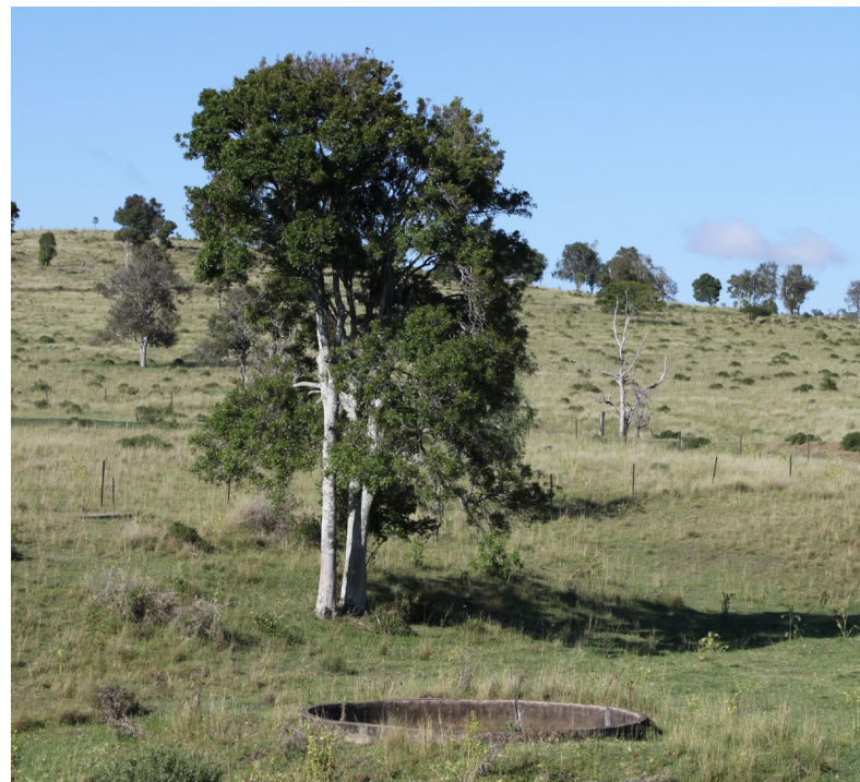
The extent of RE 12.9-10.15 prior to clearing can often be determined by the presence of isolated scrub trees that persist, despite grazing and exposure.