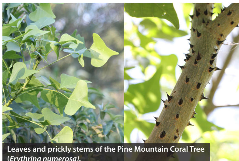
Leaves and prickly stems of the Pine Mountain Coral Tree ( Erythrina numerosa ).