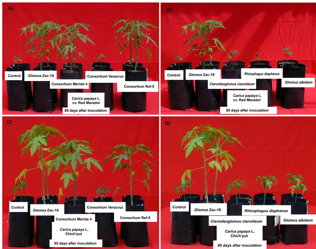
Figure 3: Growth responses of two cultivars of Carica papaya L. due to the inoculation of four arbuscular mycorrhizal fungal (AMF) consortia (A and C), and due to the individual inoculation of single fungal isolates that integrate the AMF consortium Glomus Zac-19 (B and D), after 85 days under greenhouse conditions. A and B) papaya red Maradol, and C-D) wild-type Chich'put. Identified AMF species in each consortium: Glomus Zac-19 , Claroideoglomus claroideum , Rhizophagus diaphanus , and Gl. albidum ; Consortium Merida 4 , Funneliformis mosseae , F. geosporum , Sclerocystis sinuosa and Glomus sp.; Consortium Veracruz , Acaulospora delicata , F. mosseae , F. constrictum , Gl. aggregatum and Gl. microcarpum ; and Consortium Ref-5 , Gigaspora margarita and Acaulospora delicata (Alarcon et al., unpublished data).

biotechnological potential is based on the fungal adaptation to those conditions that characterize xeric, saline or tropical environments, or to those agricultural systems in which high inputs are restricted.