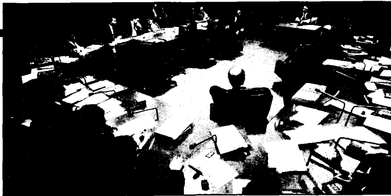
Economic Development Committee meeting.

1989-90 Minnesota House of Representatives