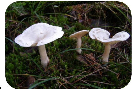
Clitocybe rivulsa

There are also a few grassland fungi in the meadow such as Clitocybe rivulsa and Hygrocybe reidii , Rickenella fibula and Stropharia caerulea which are all indicative of good quality unimproved grassland.