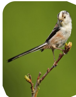
Long-tailed tit

Shrubland and the newer woodland are the domain of the Blackcap and, for those who can tell the species apart by their songs, the Garden Warbler .