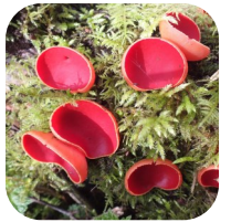
Scarlet elf cup

All FUNGI including the familiar mushrooms and toadstools, lack flowers and green chlorophyll. Many species growing on dead wood live in Dimminsdale including the purple and fleshy Jelly Ear and the Scarlet Elf Cup which bring some welcome colour in February.