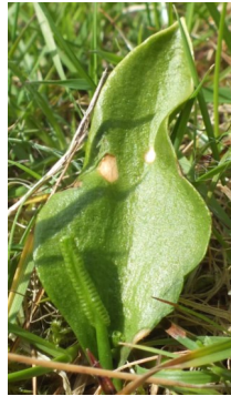
Adder's tongue fern

Adder's-tongue fern can be found in the meadow and is an unusual fern that grows in old grasslands. It usually appears between June and August, spending the rest of the year underground as a rhizome. It is considered a good indicator species of ancient meadows.