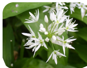
Ramson (wild garlic)

Recently epiphytic polypodys have been found growing on the trunks of an ash tree and an alder tree. Although not a rare plant, it is rare when it grows on trees.