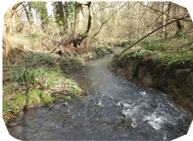
Stream running through woodland

sheltered and has a high humidity. Therefore it is particularly good for epiphytic bryophytes that grow on trees and scrub in the reserve.