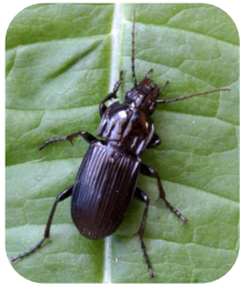
Abax parallelepipedus

Dimminsdale is in a transitional stage for beetles. Years ago, when the quarry was active, large areas of bare and partly vegetated ground were ideal for a whole suite of species which made their living by colonising newly disturbed sites. When the quarry closed down the disturbance ceased and the beetles disappeared. Now woodland has taken over most of the site.