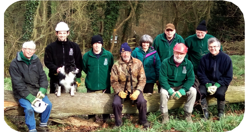
Some of the North West Friday Group volunteers