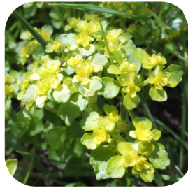
Opposite-leaved golden saxifrage

Look in the open water for the Great Yellow Cress with its shallow tall thin stalks and yellow flowers. The distribution of this plant in the county faithfully reflects the course of the main waterways. Around the margins of the open pools is the familiar Bulrush .