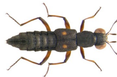
Stenus bimaculatus

The Laundry Pool is too steep-sided and too free of vegetation to be attractive to many species of water beetles. However, a whole community of ground beetles and rove beetles live around the edge, especially on shallow shelves of mud. Twenty species have been recorded so far, including the rove beetle Stenus bimaculatus ,