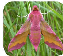
Small elephant hawk-moth

The modest list for Dimminsdale probably reflects the low level of recording rather than a lack of species present. Most are found in many other parts of the county but at least seven species, including the Triple-spotted Pug and the Small Elephant Hawk-moth , can be described as 'local' i.e. they are found in a limited number of places. One moth, the Silvery Arches , is rare enough to find its way into the county's Red Data Book of endangered species.