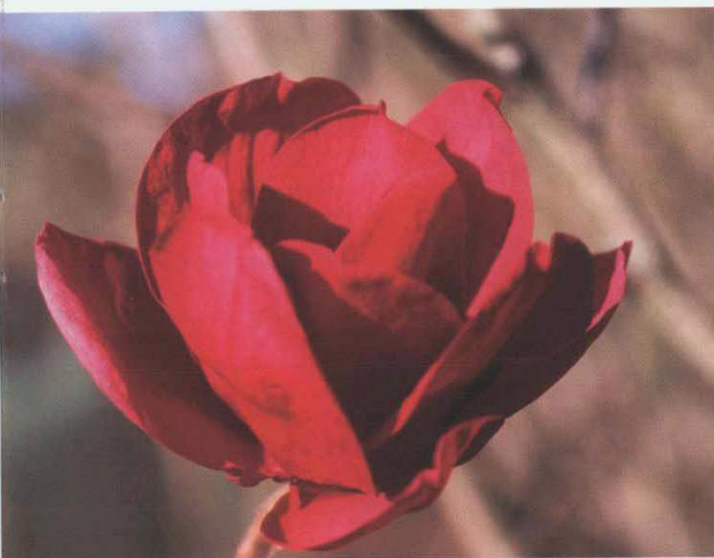
Magnolia 'Ian's Red'

to) with beautiful, large pink flowers. The other, 'Royal Purple' (see photo), is a recent introduction with, yes, royal purple flowers on a very upright-growing tree. I was fortunate to have been able to bring scions from this plant into North America (no, I don't have any available yet).