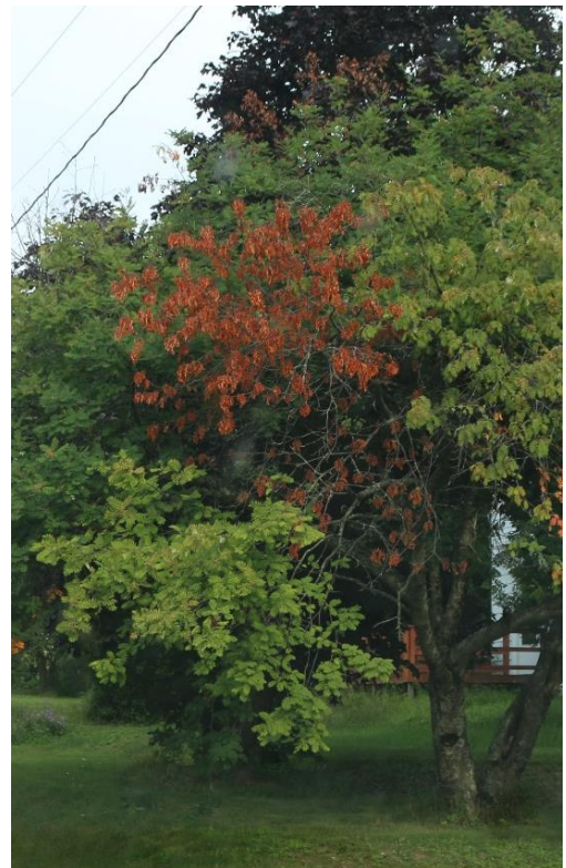
Mountain ash with fire blight.

Fire blight symptoms include quite rapid wilting and darkening of branch tips resulting in a characteristic ‘shepherd’s crook’ shape. Soaked-looking, sometimes oozing cankers can be found at the base of symptoms, while other, smaller cankers may be difficult to recognize. Bacterial ooze is the main mode of spreading infection to other parts of the