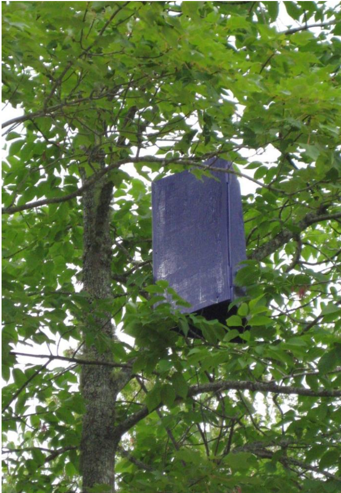
Purple traps similar to the one above captured single adult emerald ash borers in each of two locations in Grand Isle, Aroostook County.

The public is invited to an informational session on EAB on August 23 rd at 6:30 pm at the Frenchville Community Center. Department of Agriculture, Conservation and Forestry (DACF), USDA Animal and Plant Health Inspection Service and USDA Forest Service staff will be at the meeting to provide an update on EAB and respond to questions.