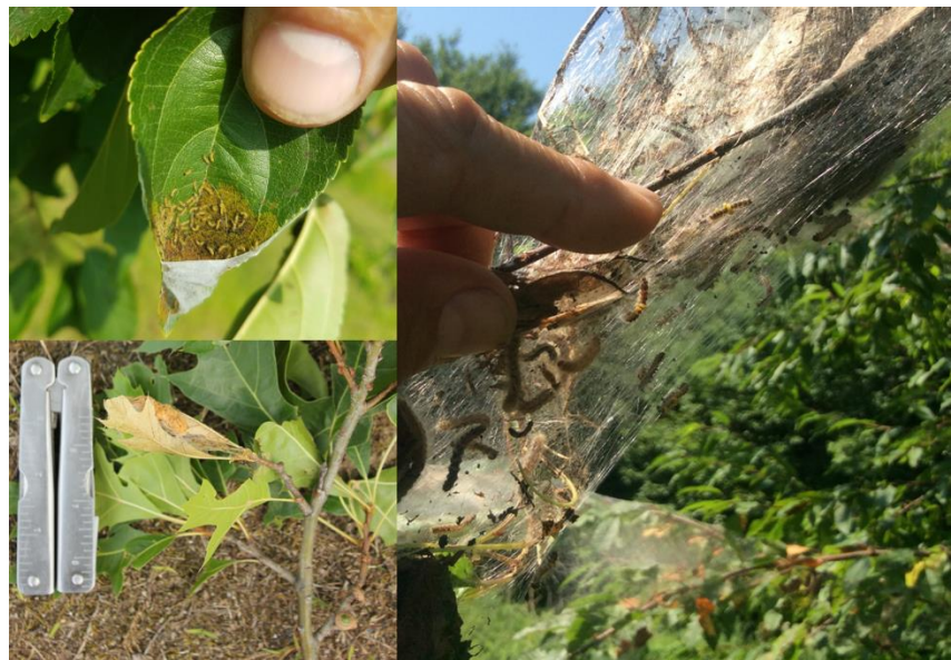
Development of browntail moth caterpillars and early webbing (left). Development of fall webworm caterpillars and webs (right). Photos from southern Maine, week of 8/6/2018, Maine Forest Service.

webworm ( Hyphantria cunea ) is confused with that of browntail moth. At this time of year, the caterpillars and webs of fall webworm are huge in comparison to those of browntail moth (see photos for comparison). Later in the fall, the fall webworm tents will become tattered and worn, and the webs of browntail moth will become more tightly woven. Be aware that the cocoons of browntail moth that were formed on trees and shrubs are still present and contact with them could result in exposure to the toxic hairs.