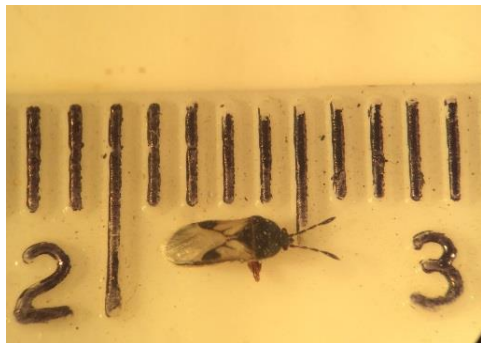
Beneficial minute pirate bugs have been reported in large numbers this year (metric ruler).

Minute Pirate Bug ( Orius spp.) – Minute pirate bugs (some of which are also called insidious flower bugs), are very small insects in the true bug family. They are very important predators on a wide