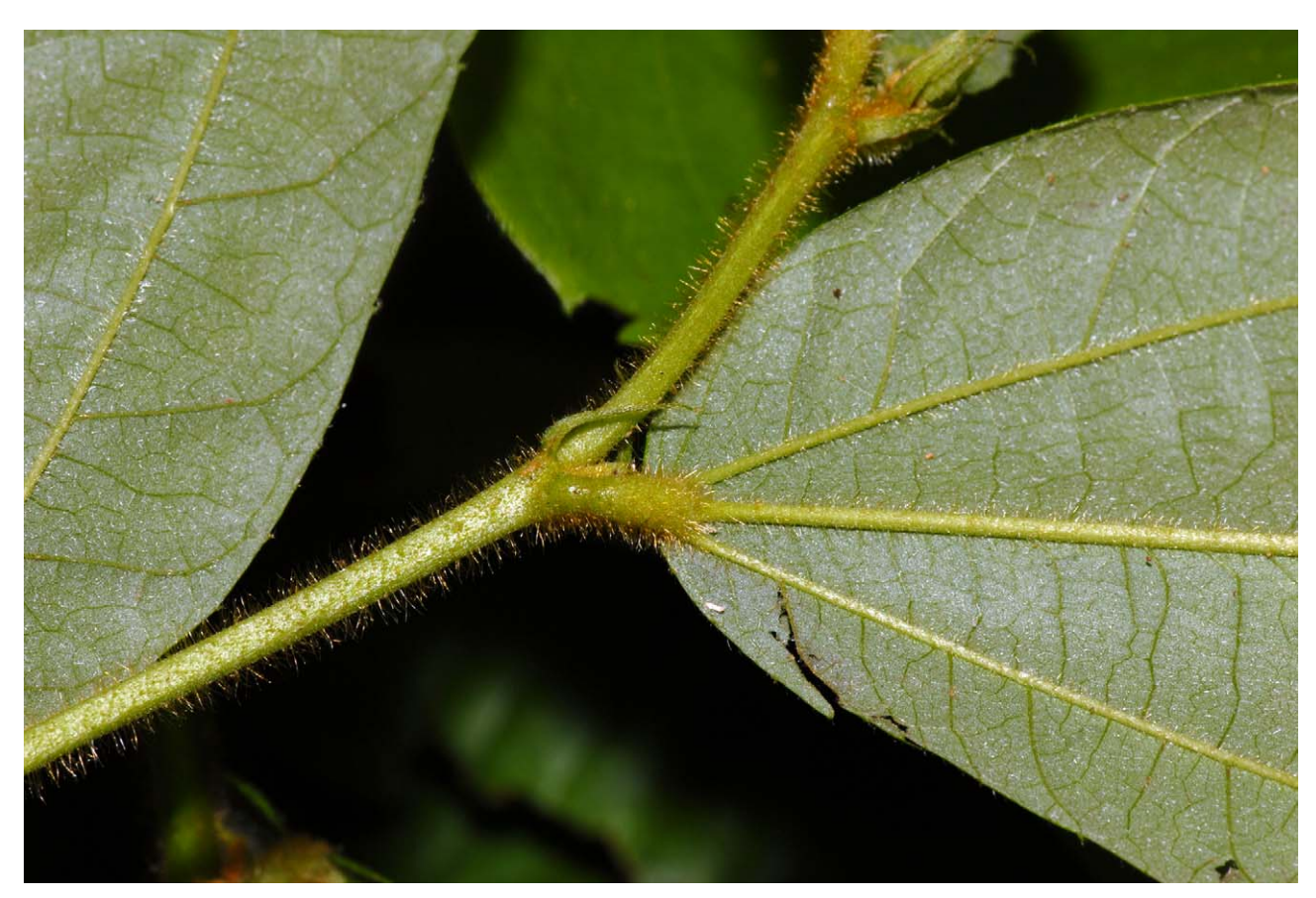
FIGURE 1. Duboscia macrocarpa. The short, stout petiole and long, straight hairs on the petiole and stem can be clearly seen.