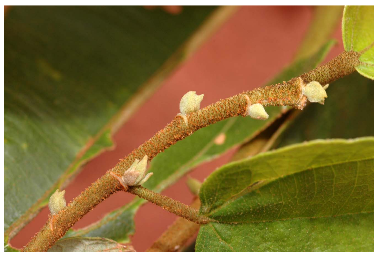
FIGURE 3. Duboscia viridiflora, with longer petiole and short, stellate hairs on the petiole.