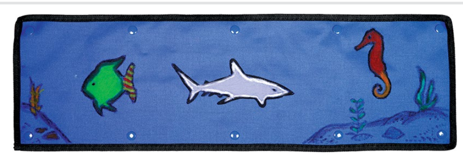
Under the Sea