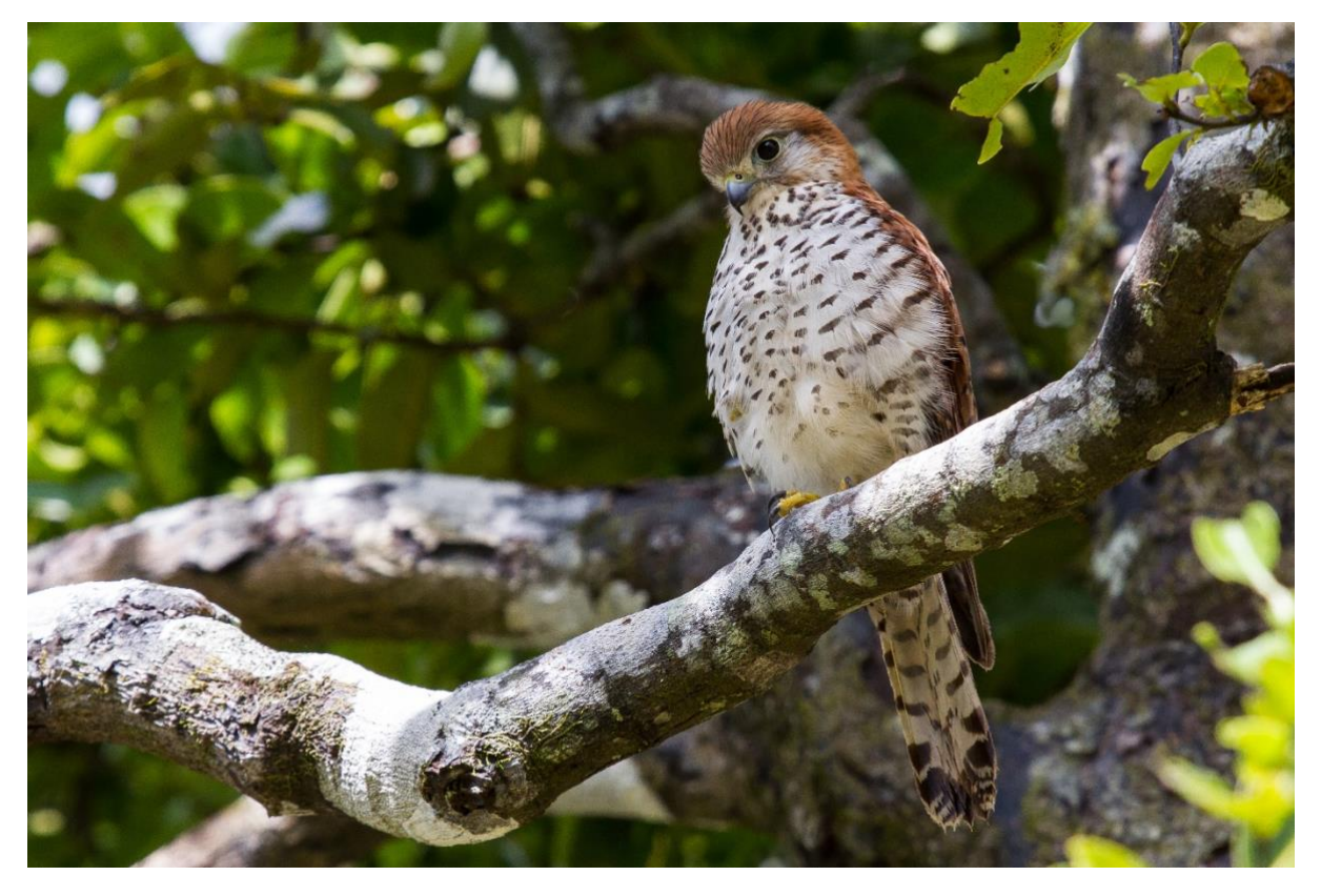
Mauritius Kestrel - proposed and accepted as our National Bird