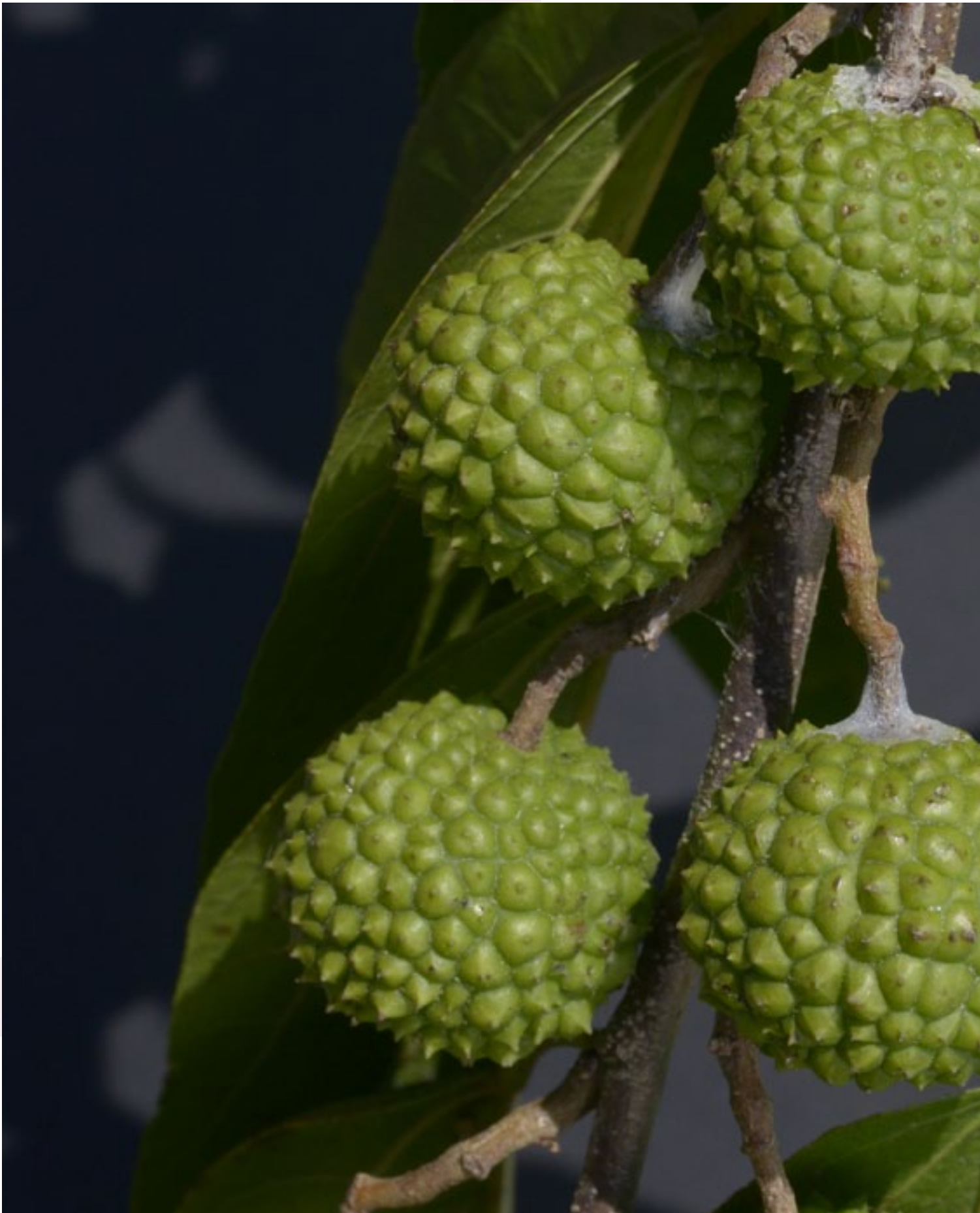
All the leaves usually drop off the tree, so you can easily see the fruits.