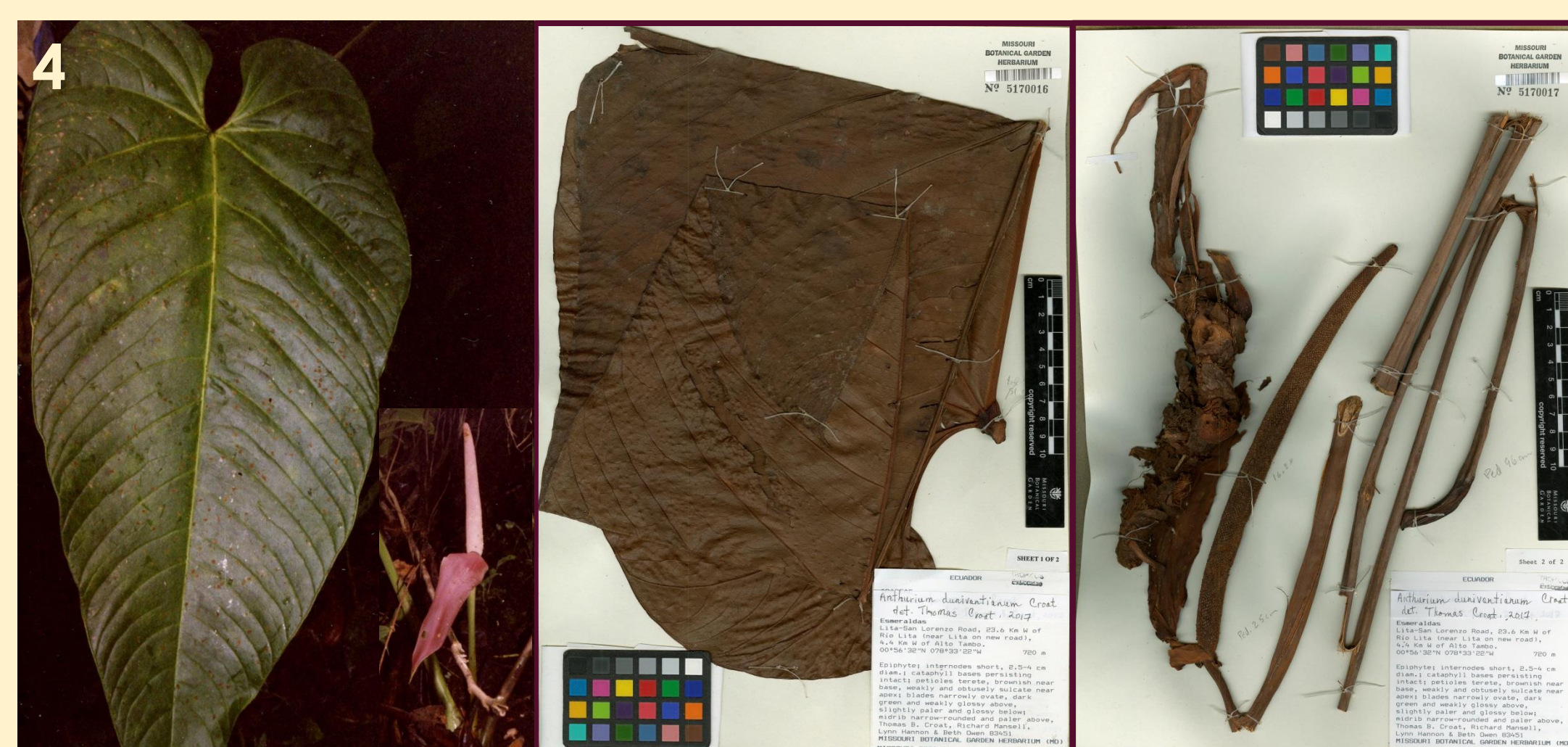
Figure 4. Anthurium dunivantianum Croat, holotype specimen and field photographs.