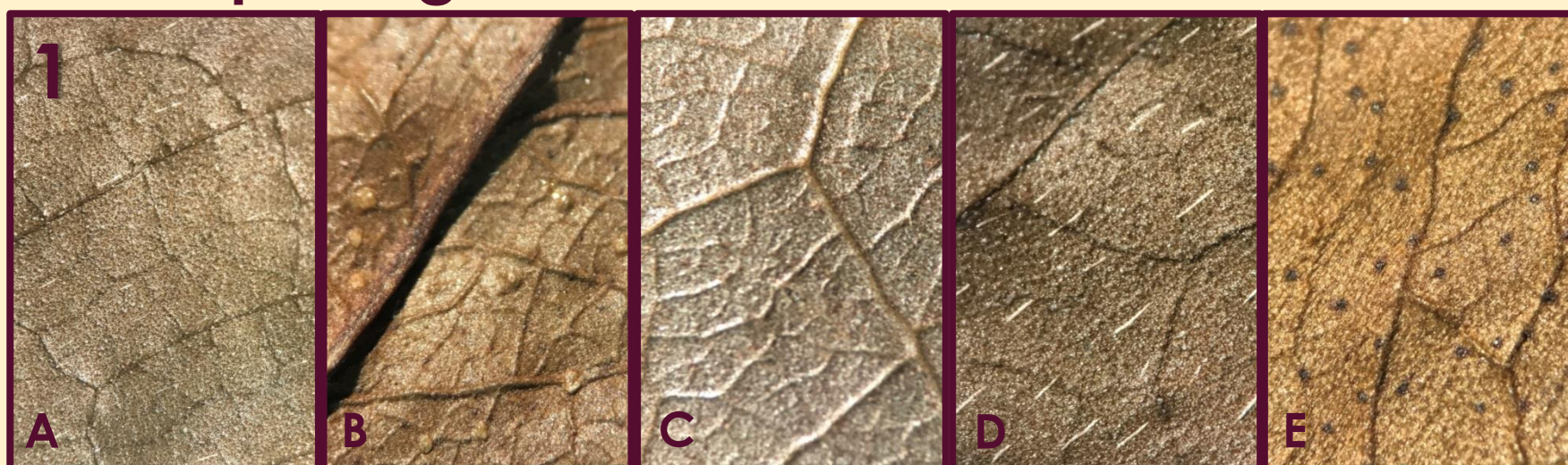
Figure 1. Leaf blade surface characters under the microscope. Anthurium species have variation on the upper and lower leaf blade surface, species may have none or multiple characters on a single surface. (A) Granular, (B) Pustular, (C) Brown-speckled, (D) Short pale-lineate, (E) dark-punctate.