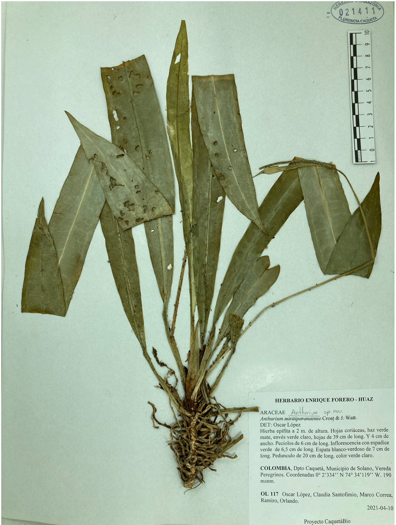
FIGURE 2. Anthurium peregrinense (López 117, HUAZ 021411). Herbarium specimen showing dried of leaves with both surfaces exposed, cataphylls, and inflorescences.