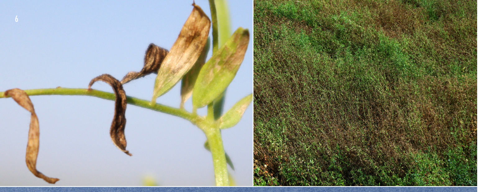
FIGURE 8. Stemphylium blight on lentil causes brown lesions that expand to a characteristic rolling of the leaves, left. Plants are defoliated, right.