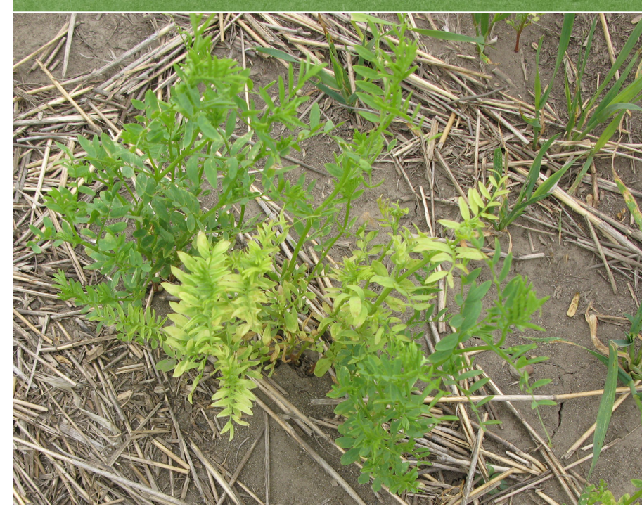
FIGURE 2. Lentil plants yellowed due to root rot, below.

FIGURE 1. Damping off is caused by many different fungi. Above, Kabuli chickpeas to the left are more susceptible than desi chickpeas, right. Note the significant loss of stand due to damping off.