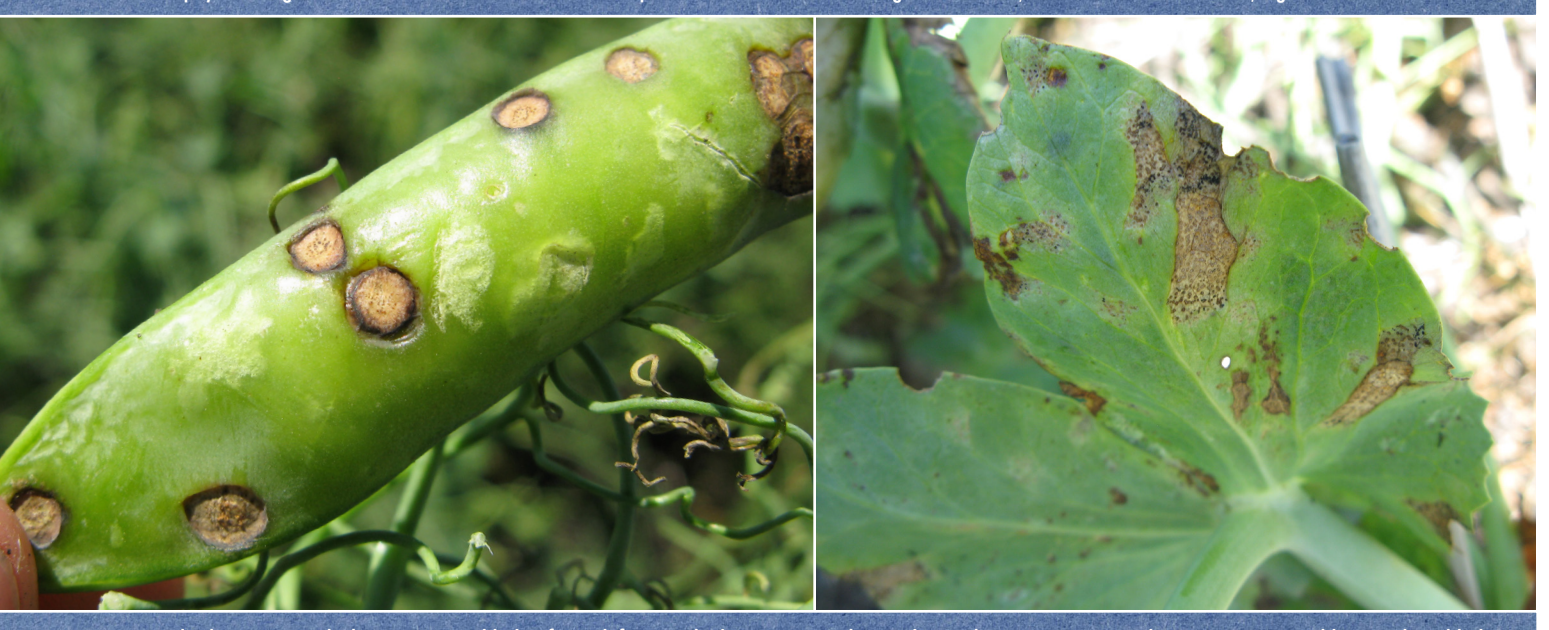
FIGURE 9. Circular lesions on pods due to Septoria blight of pea, left. Note the lesions are sunken and pycnidia are not organized in concentric rings like Ascochyta blight. Irregular shaped leaf lesions on a pea leaf due to Septoria blight, right.

Dakota and Montana seed labs will test for Ascochyta. Please contact them directly for submission and fee instructions (contact information can be found on the outside back cover). We recommend zero percent seed-borne infection for Ascochyta in chickpea, and below five percent for pea and lentil. These levels are based on recommendations from other pulse-growing areas as well as the relative susceptibility of the crop. Thiabendazole (Mertect), azoxystrobin (Dynasty), and pyraclostrobin (Stamina) have shown efficacy against seedborne Ascochyta. Fluxapyroxad (Xemium) has also shown efficacy in preliminary trials, but is not currently formulated as a seed treatment for pulse crops. Due to the presence of strobilurin-resistant strains of Ascochyta in chickpea crops in Montana and North Dakota, we do not recommend the use of azoxystrobin or pyraclostrobin on chickpea. In North Dakota, resistant