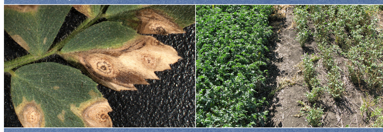
FIGURE 7. Ascochyta blight lesions on chickpea usually have a characteristic ring pattern. Lesions coalesce and cause defoliation. In the photo on the right, chickpeas resistant to Ascochyta blight (left) are not defoliated by the disease compared to the susceptible variety (right).