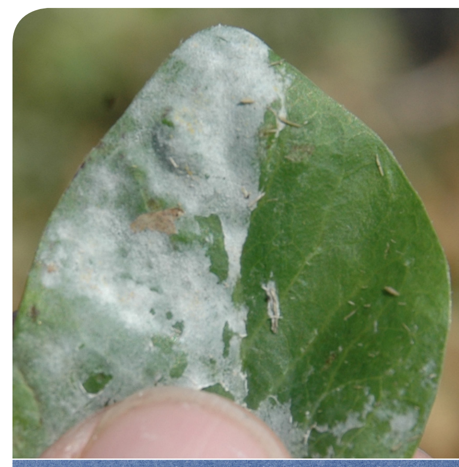
FIGURE 10. Powdery mildew, top, forms a white mat of fungal hyphae on the leaf surface and can be rubbed off. Fungicides and dessicants cannot penetrate this thick layer of fungus.

Gray mold (Botrytis) is considered of minor importance on pulse crops in the United States, but can be serious when flower and pod infection occur. The disease is caused by Botrytis cinerea in chickpea and lentil. Symptoms initially start as water-soaked lesions on stems, branches, leaves, flowers, and pods, then progress to grey/brown lesions and are often covered with a grey fuzz consisting of fungal hyphae and spores. The pathogen attacks all aerial parts of the plant, but prefers blossoms and pods.