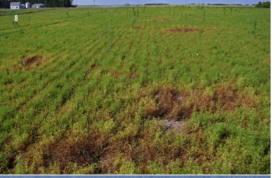
FIGURE 11. A lentil field infected with Botrytis grey mold. FIGURE 12. Symptoms of white mold on chickpea stems.