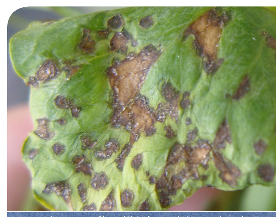
FIGURE 4. Above, Symptoms of bacterial blight of pea. Angular lesions turn brown when the leaf tissue dies. Bacteria ooze from lesions under high moisture conditions and dry on the leaf surface. Below, water-soaked lesions and bacterial ooze where hailstones hit a petiole.

The pathogen is seedborne, and contaminated seed is considered the most important source of inoculum for field epidemics. The pathogen also survives on stubble and in the soil.