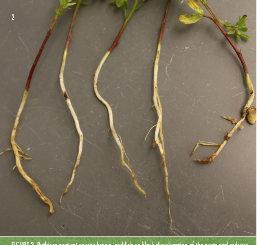
FIGURE 3. Pythium root rot causes brown, reddish or black discoloration of the roots and reduces the number of secondary roots.

Pythium root rot is caused by the oomycete (water mold) Pythium spp. It is characterized by poor root system development, and can be difficult to diagnose. In general, roots will be brown in color and the outer cortex will peel off of the inner core of the root (Figure 3). Pythium is very common in the soil and for this reason it is recommended that all seed treatments contain metalaxyl or mefanoxam.