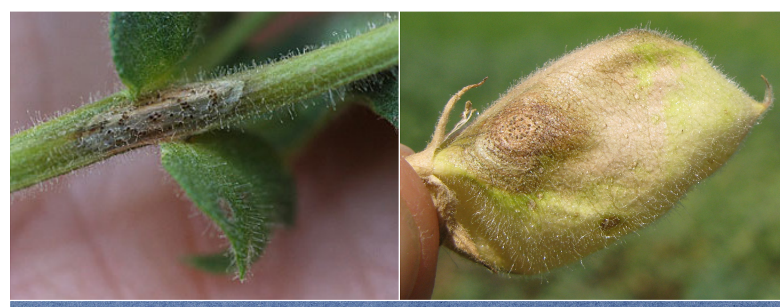
FIGURE 6. Ascochyta blight causes stem lesions that can lead to stem breakage, left. Pod infection, right, can lead to discoloration and shrivelling of seed as well as seed transmission of the pathogen.