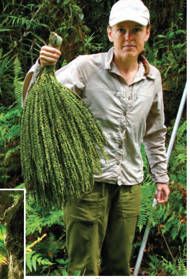
Collecting Clinostigma exorrhizum, Tomaniivi Nature Reserve, Fiji.

Fieldwork for this project was performed at four sites across two island nations: 'Eua National Park (Tonga), USP campus (Fiji), Colo-i-Suva Forest Park (Fiji), and in the Tomaniivi Nature Reserve (Fiji). This expedition resulted in the collection of hundreds of seeds from nine species endemic to either Tonga or Fiji, 17 herbarium specimens with duplicates for herbaria at the Bishop Museum (BISH), the Royal Botanic Garden Kew (K), the New York Botanical Garden (NY), and the University of the South Pacific (USP). Seeds