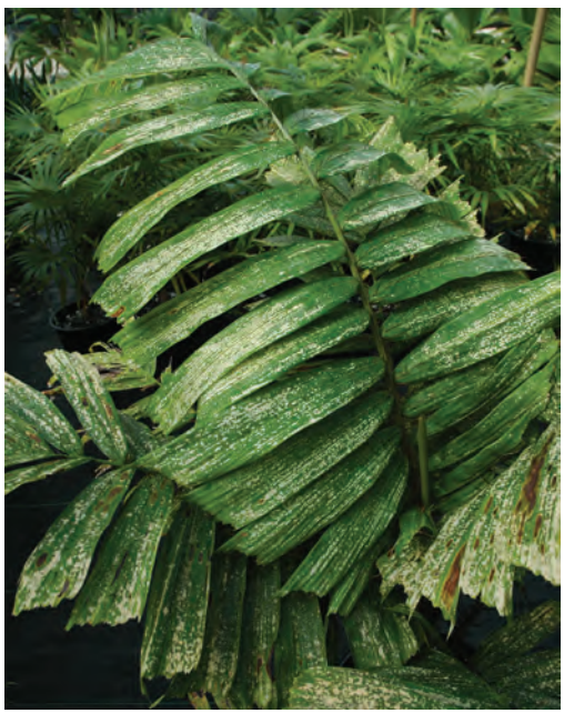
Cold damage to Aiphanes minima fronds.

hope that it is another 70 years before a winter like 2010 passes our way again.