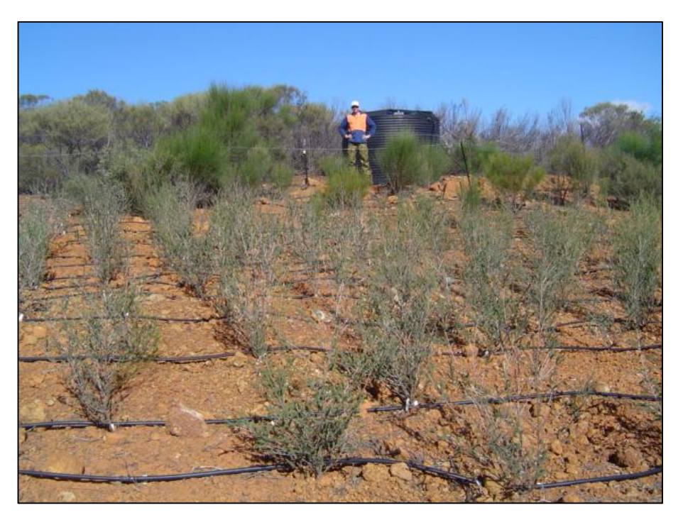
Figure 1: D. masonii growing at Iron Hill East, south of the main project area at Extension Hill (photograph taken in June 2008).

MGM and EHPL have Ministerial approval to take approximately 2100 adult plants or 14% of the population during mining that is inclusive of all plants within the approved footprint (Ministerial Statement 753).