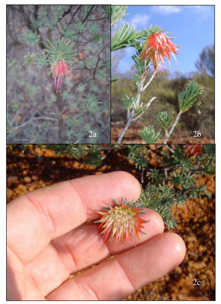
Figure 2: 2a to 2c D. masonii flowering inflorescences depicting shape and size (June 2008).

Statement 29 (CALM, 1995) will be consulted in regards to translocation of threatened flora. There is strong evidence to suggest that D. masonii recruits well post disturbance as evidenced by strong recruitment in previously cleared exploration tracks and drill pads (documented in monitoring work).