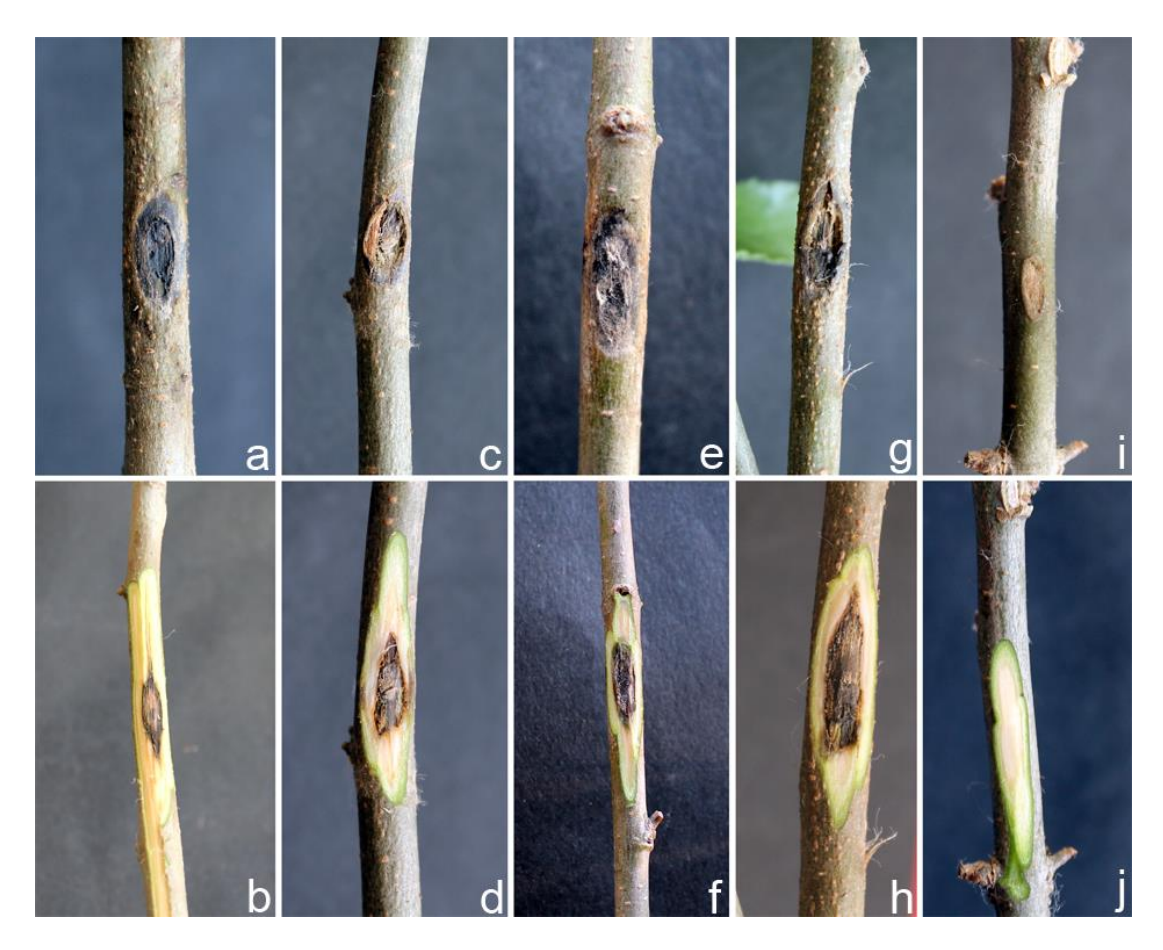
Fig. 4 – Symptoms on European hackberry seedlings 40 days after inoculation with Sardiniella urbana strain BL179 (a, b); BL180 (c, d); BL181 (e, f); BL182 (g, h). Control seedlings (i, j).

Notes – The conidial wall of S. urbana is frequently undulate or irregular. It is not clear if this is a characteristic of the genus or of this particular species.