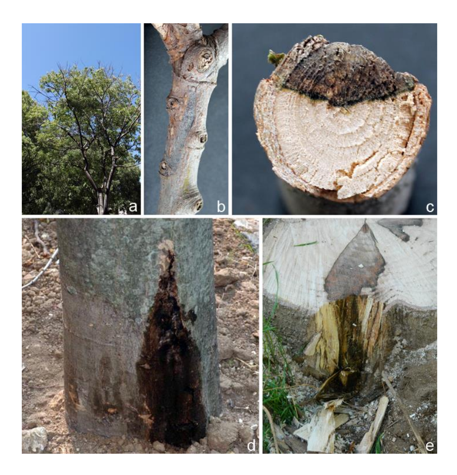
Fig. 1 – Main symptoms on European hackberry trees growing on a street verge. Progressive dieback of twigs and branches (a); branch with bark necrosis visible at level of a sunken cankers (b); cross section of a branch showing a characteristic wedge-shaped necrotic sector (c); an active sunken canker in the trunk wet with blackish exudates (d); cross section showing extensive necrotic lesion of xylem tissues corresponding to a canker (e).