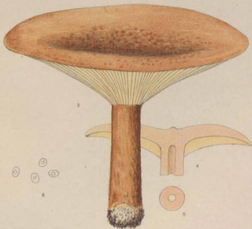
LACTARIUS AQUIFLUS PK. WATERY MILK LACTARIUS