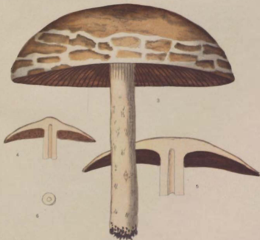
HYPHOLOMA BOUGHTONI Pk. BOUGHTON HYPHOLOMA