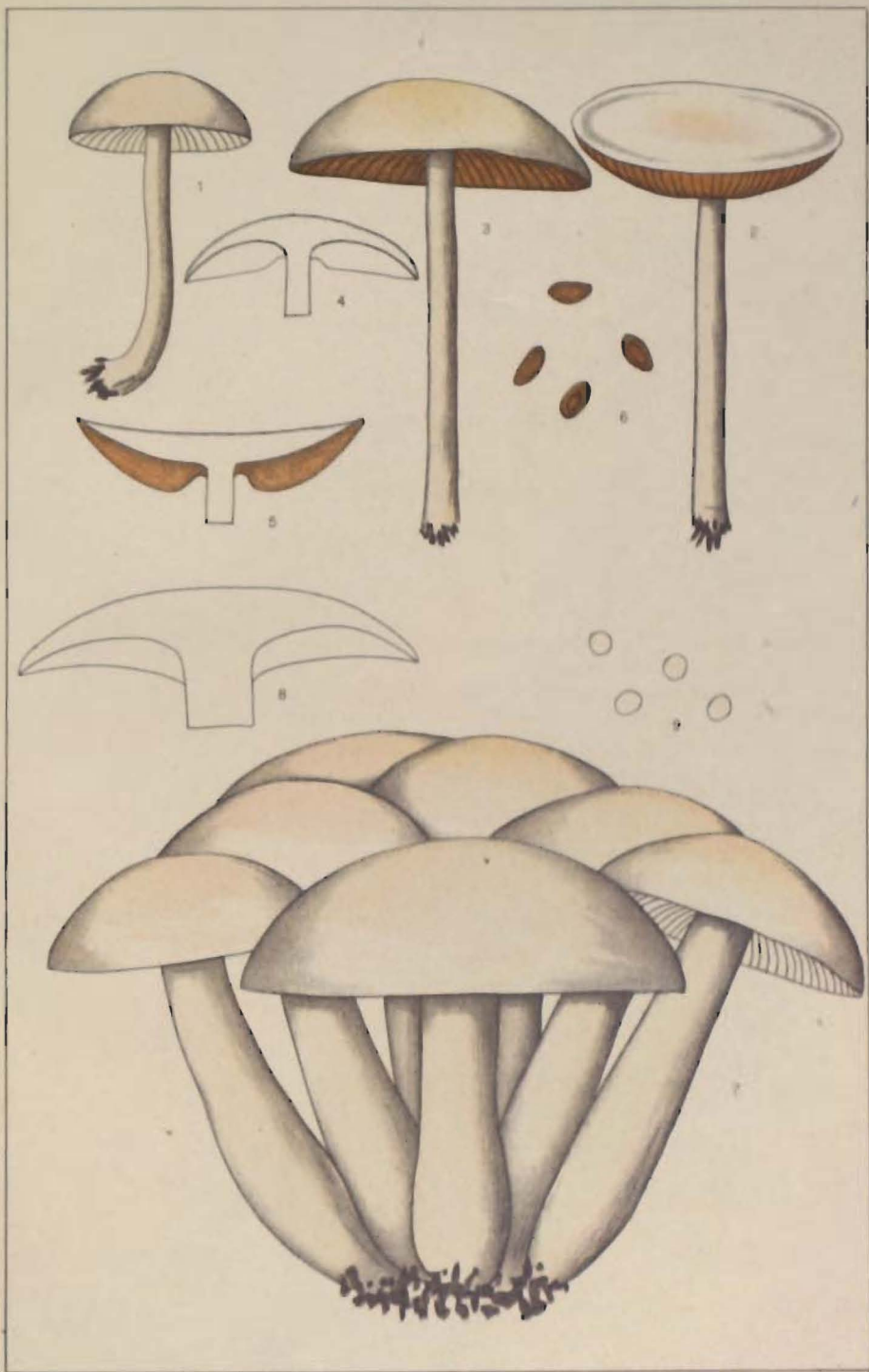
FIG. 1-6 HEBELOMA ALBUM Pk. WHITE HEBELOMA