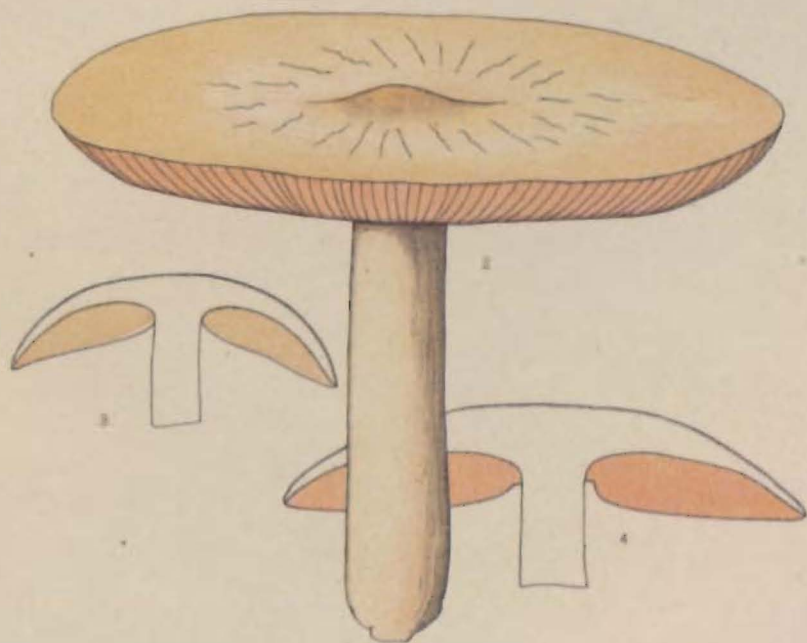
ENTOLOMA GRANDE Pk. GRAND ENTOLOMA