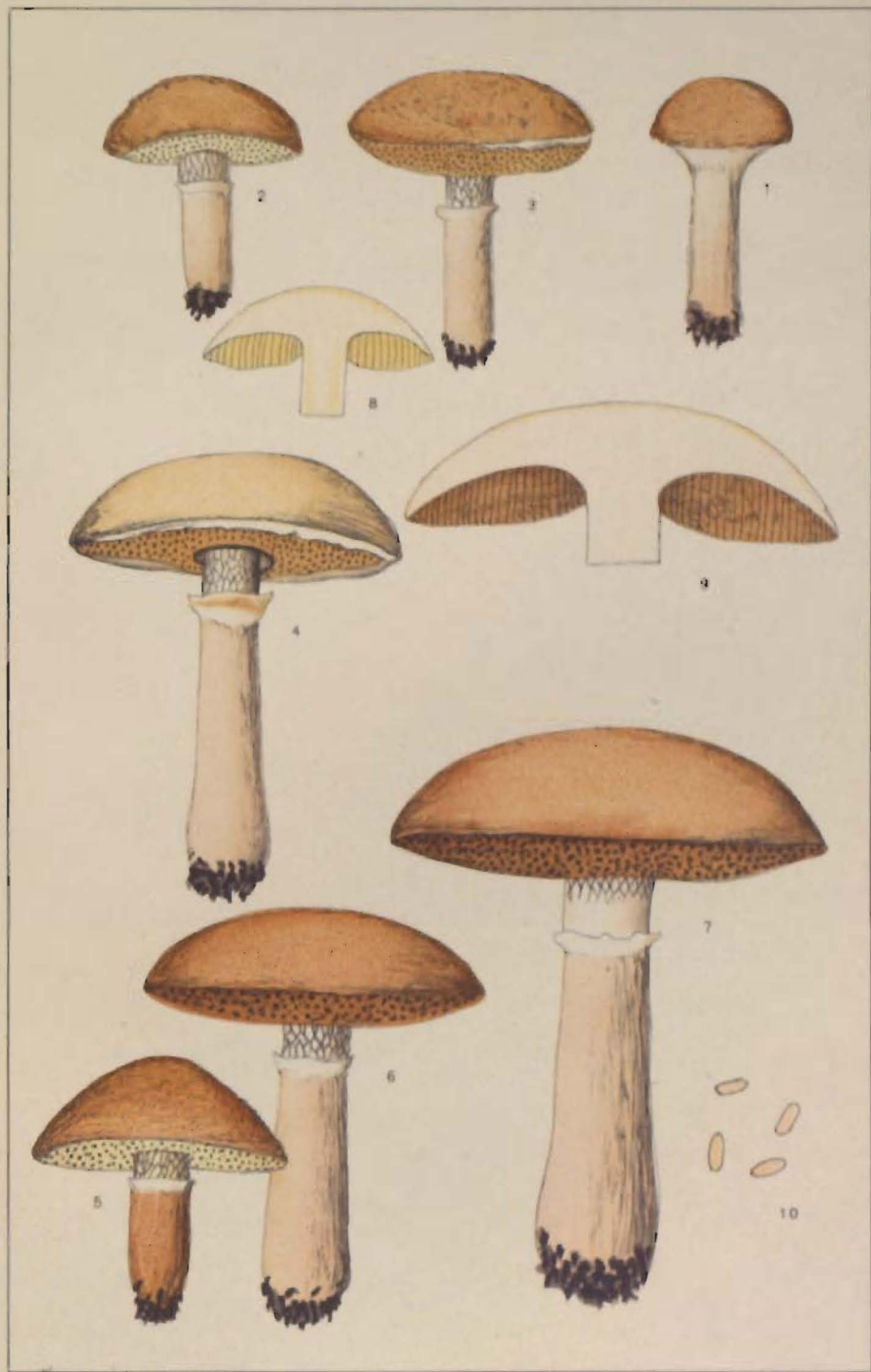
BOLETUS VIRIDARIUS FROST GREEN LAWN BOLETUS