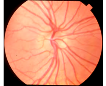
Multiple Branches of Blood Vessels

Optic disc drusen are usually not visible at birth and are rarely found in infants and children. The drusen tend to develop slowly over time as the abnormal material collects in the optic nerve head and calcifies. The average age when optic disc drusen first appear is about 12. Often, the optic disc has an unusual appearance, with multiple branches of the major blood vessels as they emerge on the disc.