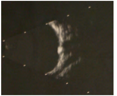
Ultrasound Showing Large Druse

Optic disc drusen either can be buried within the substance of the optic nerve head or located superficially on the surface of the optic nerve head. When the drusen are superficial, they appear as glistening yellow bodies just below the surface of the optic nerve head and can be seen by ophthalmoscopic examination. When the optic disc drusen are buried deep in the disc, the drusen are hidden from direct view by the ophthalmoscope but can be identified by ultrasound.