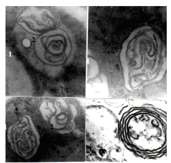
Figure 3. Ultrastructure of β- conidia Phomopsis lirelliformis: 1 – membrane accumulations; 2 – autophagic vacuoles

Current Trends in Natural Sciences (CD-Rom) ISSN: 2284-9521 ISSN-L: 2284-9521