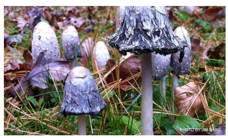
According to Dr. Denis Benjamin, it's OK to drink alcohol if you eat Coprinus comatus – but these are past their edible stage anyway!

<sup>1</sup> Clin Toxicol (Phila). 2010 May; 48(4):365-72 <sup>2</sup> Fungi, 2014, 75(5):1-16.