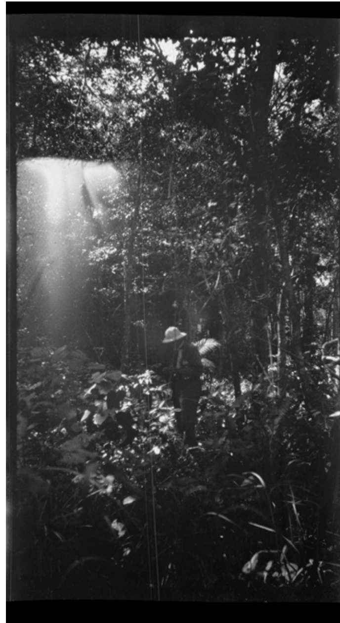
Herbert Basedow examining plants on Mannakai station, Northern Territory 1922 or 1928

There are at least two species of plants that once carried his name — the herb Goodenia basedowii (named in 1912) and the rush Typha basedowii (named in 1915) — but these have since been determined not to be new species after all. Under the laws of nomenclature these revert to the original name of the species. Of the six species of nudibranchs described by Basedow and Hedley in 1905, five remain classified as new species, despite four being later reassigned to different genera. 9