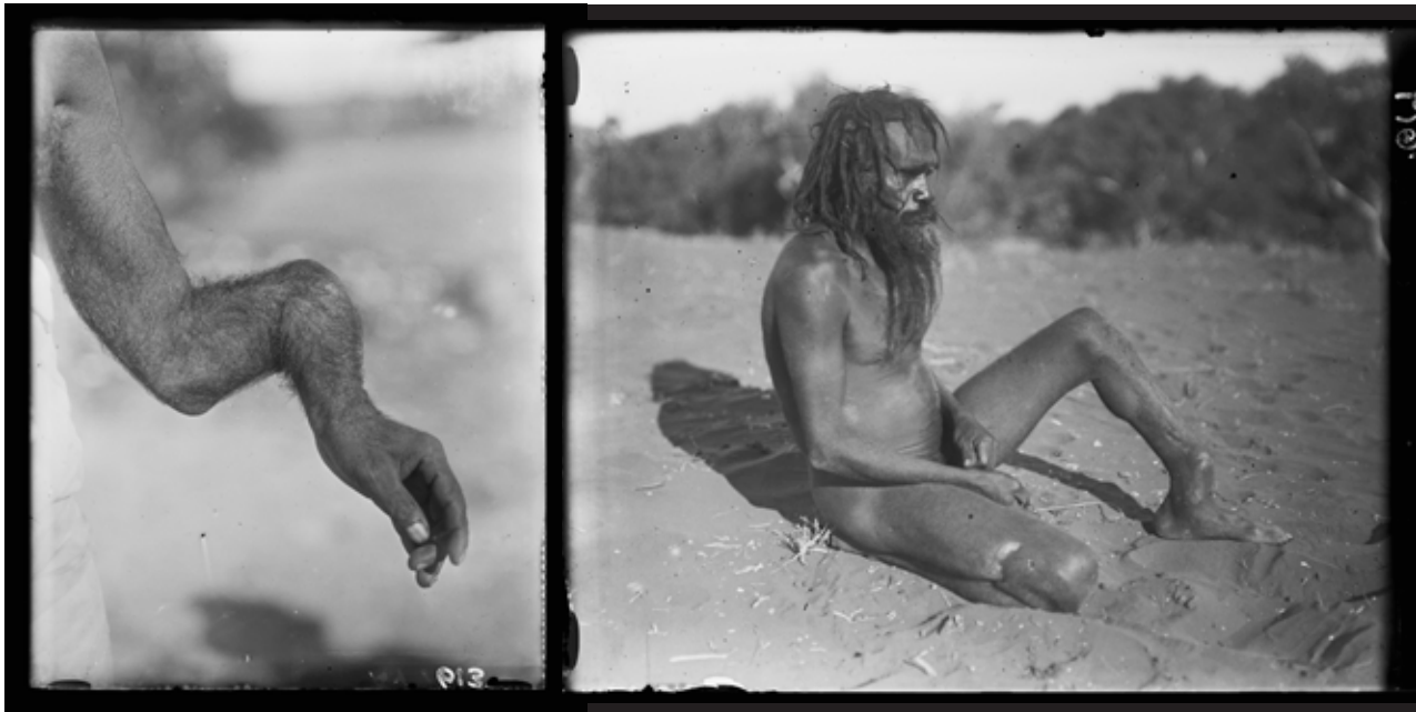
Ununited fracture of a man's arm, Denial Bay, South Australia 1920