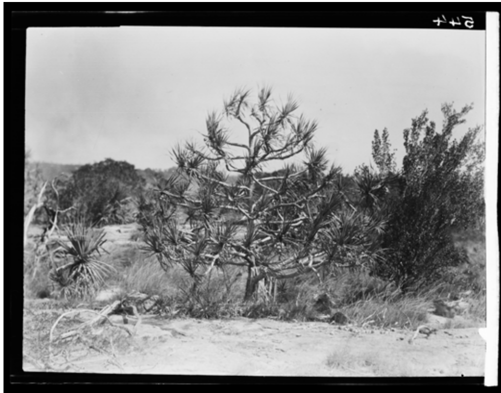
Pandanus basedowii , northern Arnhem Land, Northern Territory 1928