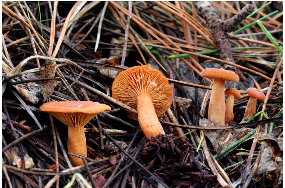
The candy cap, Lactarius rubidus, from coastal northern California. Caps are pale orange to orange-brown, dry to moist, latex thin, watery-white, scanty to absent, odor when fresh mildly pleasant, when dried or cooked strongly aromatic, like maple syrup or fenugreek.