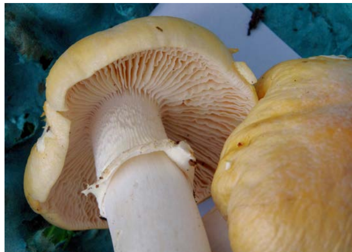
The gypsy mushroom, Cortinarius caperatus.

For membership questions, please email 360nmamembership@gmail.com