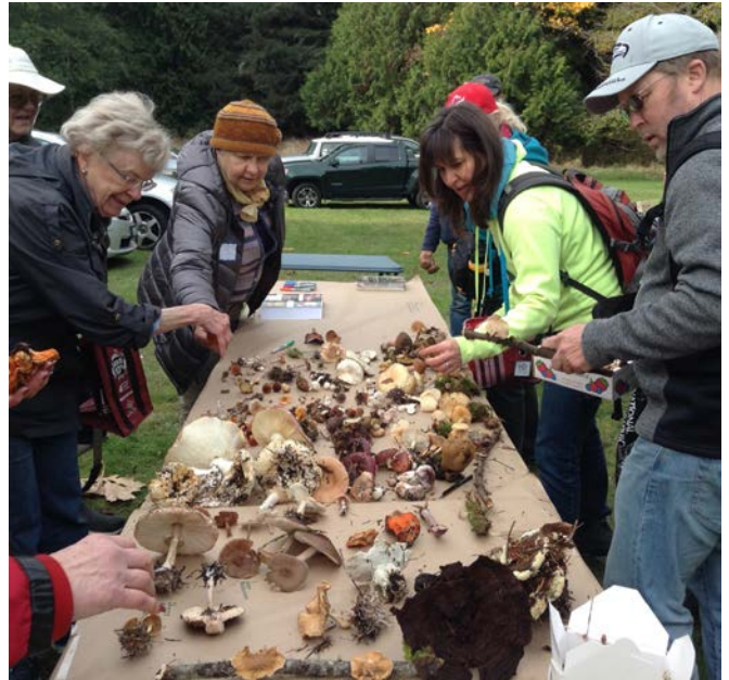
Last year's Lummi Island fall foray.