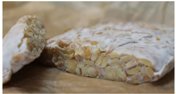
Freshly fermented tempeh.