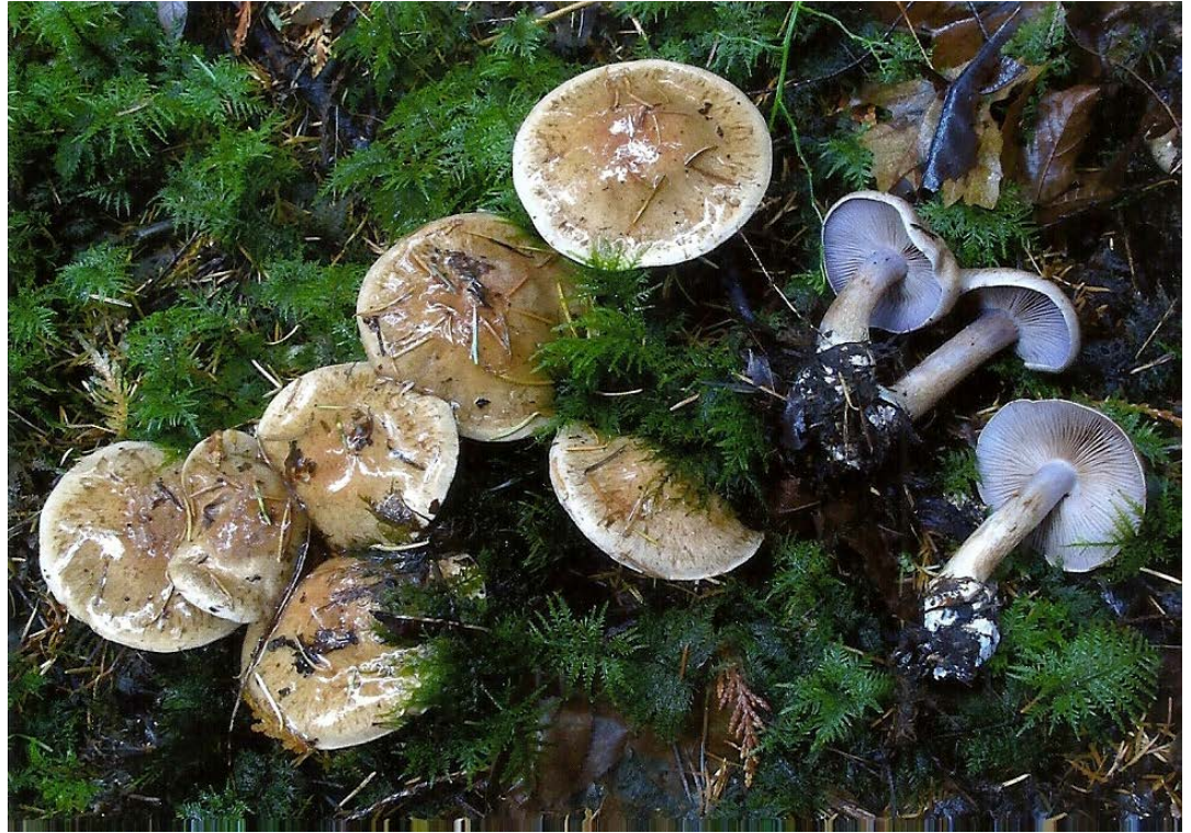
Cortinarius riederi .

The viscid caps and dry stems immediately placed it in the Subgenus Phlegmacium. I soon arrived at Section Glaucopodes, and here I stopped. The Cortinarius glaucopus group is quite showy, but also encompasses several varieties including the var.