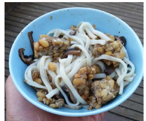
Udon and meadow mushrooms with tempeh in black pepper sauce