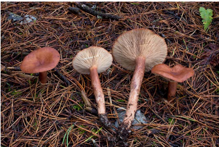
Lactarius rufus , named the Red Hot Milk Cap due to its acrid and peppery taste