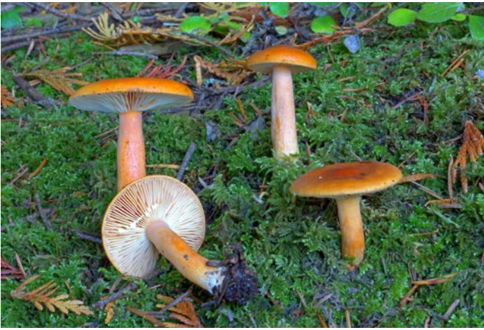
Lactarius luculentus var. laetis , the species identified in the 2008 Bellingham candy cap cold case