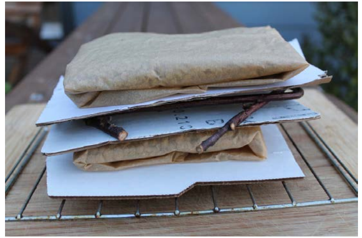
Soybeans wrapped in parchment and stacked, ready for the incubator

Surprise! Freshly fermented tempeh has the most lovely aroma: I think it smells like apple cider with moist almonds. Even my bean-phobic wife describes it favorably as “peanuts and vanilla.” Like the aroma of a fresh Prince mushroom, these aromas do not survive much cooking.