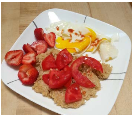
A simple breakfast, rice tempeh

[1] https://www.ncbi.nlm.nih.gov/pubmed/15740082