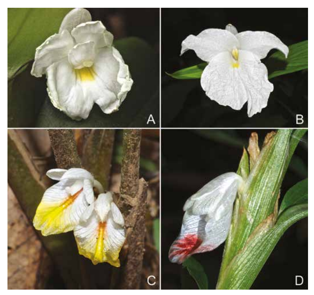
Fig. 4. Boesenbergia flower diversity. A. Boesenbergia uniflora from Sarawak. B. Boesenbergia alba (K.Larsen & R.M.Sm.) Mood & L.M.Prince from Thailand. C. Boesenbergia loerzingii (Valeton) K.Larsen ex M.F.Newman, Lhuillier & A.D.Poulsen from Indonesia. D. Boesenbergia pulcherrima (Wall.) Kuntze from Thailand.

three included species of Boesenbergia as well as all Haplochorema accessions (100% BS). The seven Haplochorema samples form a monophyletic clade with strong (96%) bootstrap support, but that clade is embedded within a clade with Boesenbergia species. Specifically, Boesenbergia rotunda (L.) Mansf. is sister (71% BS) followed by B. clivalis (Ridl.) Schltr. (98% BS), and B. ochroleuca (Ridl.) Schltr. (94% BS). Relationships among the Haplochorema samples were not strongly supported. The trnK analysis was based on 125 PPIC and generated 33692 shortest trees. Results of the trnK analyses showed the same three Boesenbergia taxa as closest relatives to all Haplochorema samples, although in slightly different order, and with bootstrap values ranging from less than 50% to 85%. The combined matrix (312 PPIC) analysis produced 1183 shortest trees with overall topology similar to the independent analysis phylogenies.