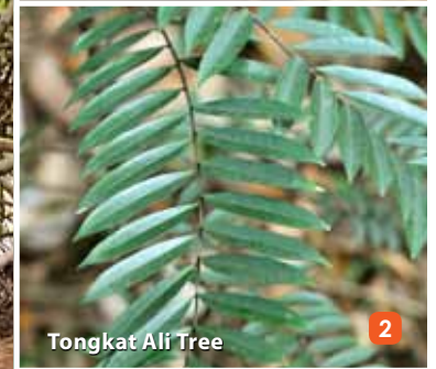
Tongkat Ali Tree