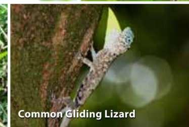
Common Gliding Lizard