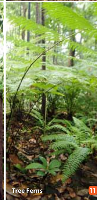
Tree Ferns 11