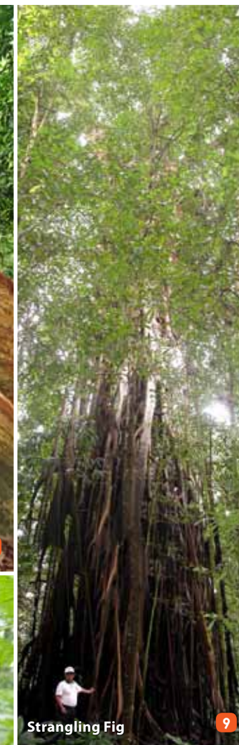
Strangling Fig 9