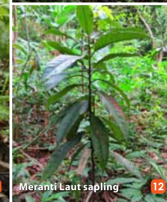
Meranti Laut sapling 12