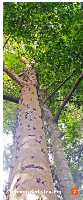
Common Red-stem Fig 7

The rainforest is also planted with saplings of rare native trees such as Meranti Laut ( Shorea gratissima ), Diospyros pilosanthera and Hopea ferruginea . This is to ensure that the next generation of trees is ready to take over some of the declining mature trees, with a bit of help from us humans.