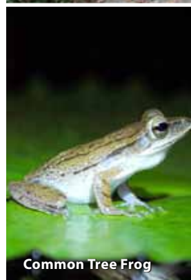
Common Tree Frog