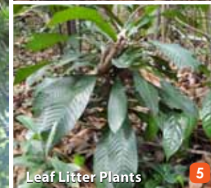
Leaf Litter Plants