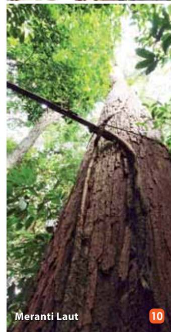
Meranti Laut 10