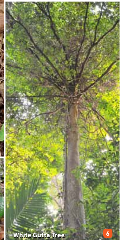
White Gutta Tree