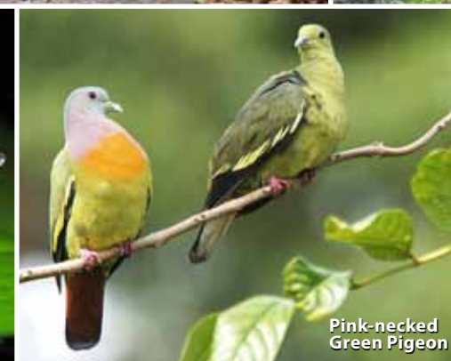
Pink-necked Green Pigeon