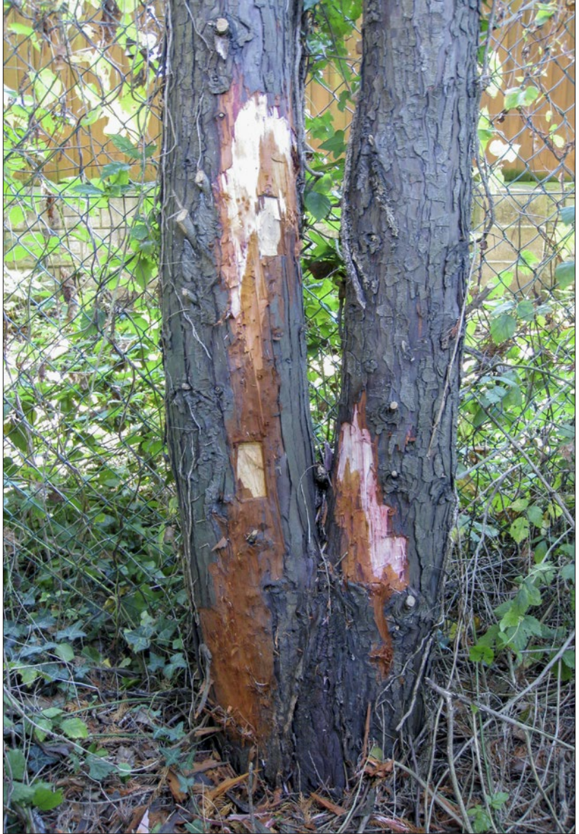
Base of a Lawson cypress tree showing necrotic bark lesions resulting from root collar infection by Phytophthora lateralis .