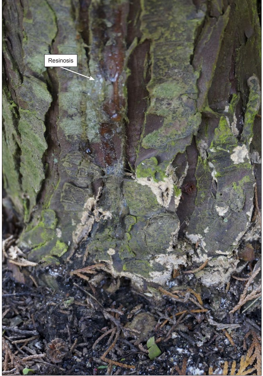
Resinosis associated with underlying Phytophthora lateralis lesions at the base of the stem of a Lawson cypress tree.