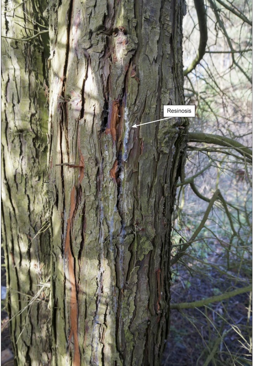
Resinosis associated with underlying Phytophthora lateralis lesions on the stem of an infected Lawson cypress tree.