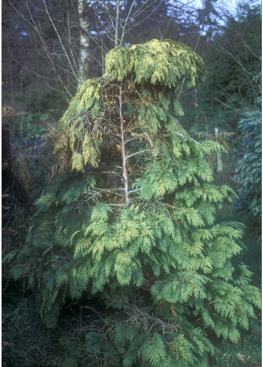
A Lawson cypress tree infected by the fungal pathogen Nectria cinnabarina . The upper part of the tree is dying as a result of a girdling stem canker (visible as a chestnut brown patch along the stem).