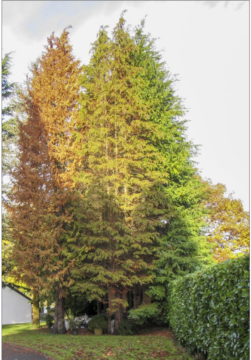
Lawson cypress trees at different stages of infection by Phytophthora lateralis .