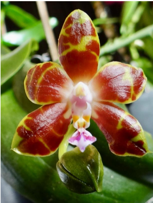
Leon Skorczewski's Phalaenopsis venosa