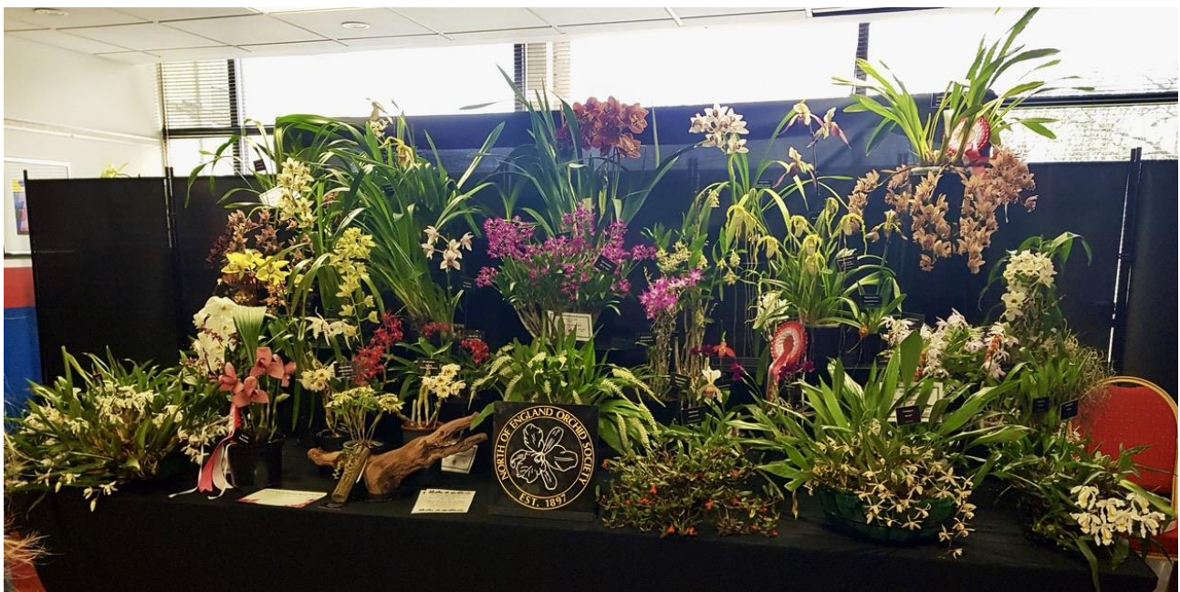
The North of England displayed a wide range of genera.