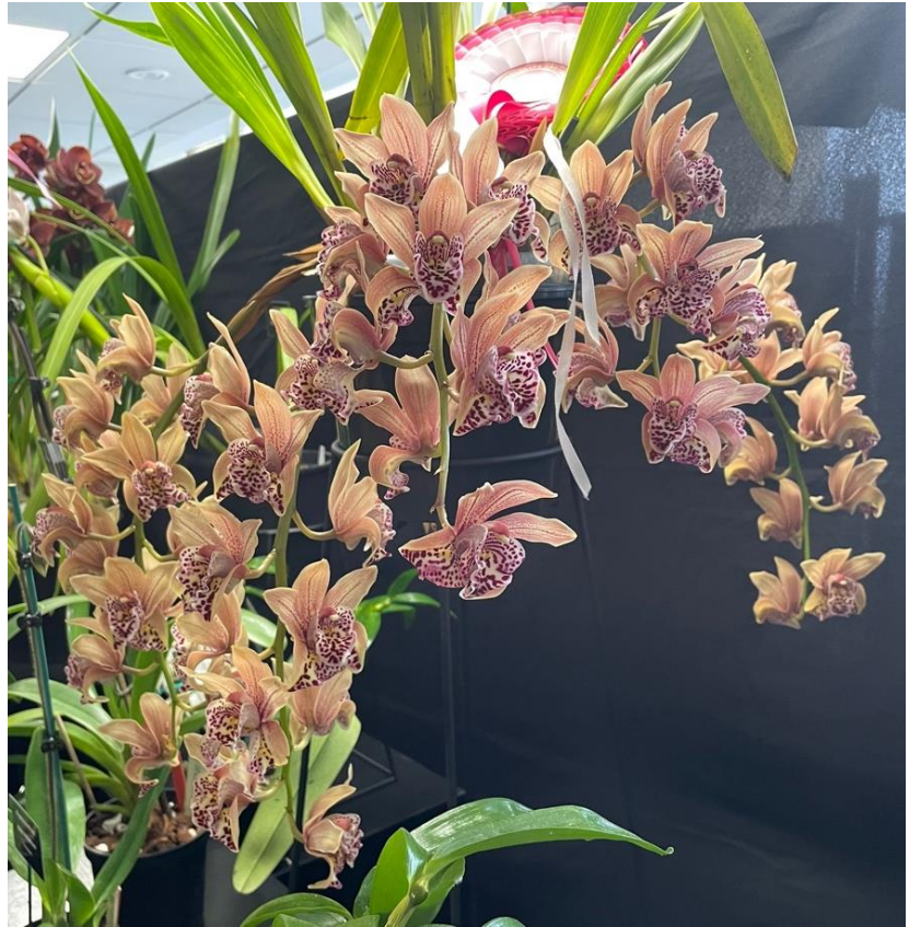
Phil Howard's peloric* Cymbidium King Freak x devonianum

*For anyone unfamiliar with the term, peloria is the term given to the mutation where the upper petals or, as in this cymbidium , the lower half of the sepals take on the colours, patterning or structural characteristics of the labellum (the "lip" petal of the orchid).