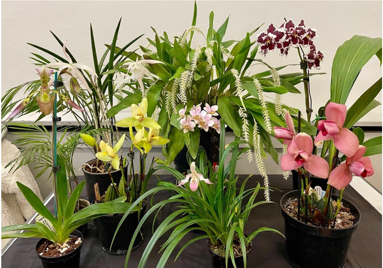
In close-up: Phoenix's Phalaenopsis Philadelphia