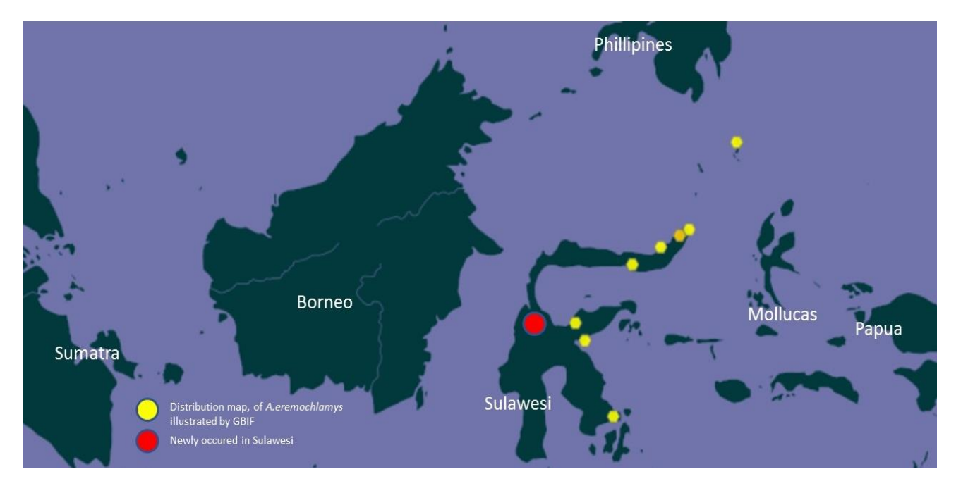
Fig. 2. Distribution map of Alpinia eremochlamys and the new locality in Sulawesi, Indonesia.

Distribution: Endemic to Sulawesi (Newman et al. , 2004) Sulawesi distribution: Northern Sulawesi (Kinho, 2011), Southeastern Sulawesi (GBIF, 2020) and Central Sulawesi (Fig. 2).