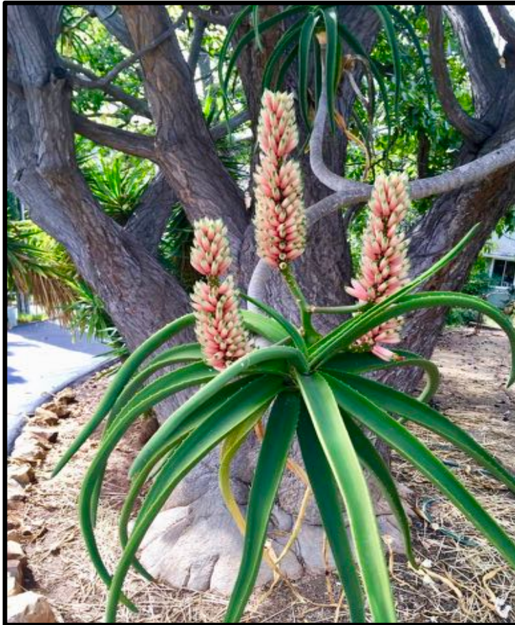
Above: Ron Chisum's 8' diameter Aloe barberae ( bainesii ) with huge bloom stalks!