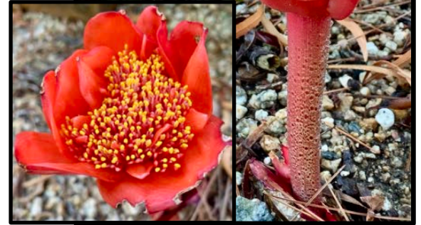
Susan LaFreniere's Haemanthus coccineus bulb in bloom – from September