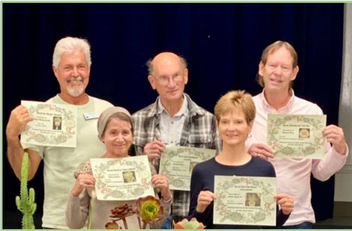
October 2019 Show Winner's Table winners received their certificates!