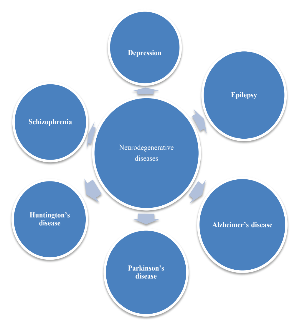
Fig. 1. Neurodegenerative diseases of human beings.

Ab peptide. Plant extract is effective against optical hypertension. Chiu et al. demonstrated that plant is effective for preventing cell death induced by glutamate. It also inhibits secondary degeneration of retinal ganglion cells and inhibits the increase of p-JNK and p-ERK [63].