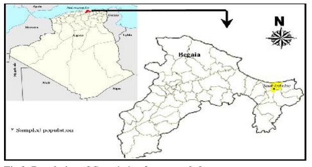
Fig 2: Population of Senecio jacobaea sampled