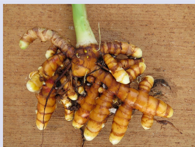
Figure 3: Rhizome of Curcuma longa L..

The turmeric or yellow ginger Curcuma longa L. (1753) presumably arose by selection and vegetative propagation of a hybrid between the wild turmeric Curcuma aromatica Salisb. that is native to India, Sri Lanka, and the eastern Himalayas, and other closely related species. As a result, C. longa is not found in the wild and is only known as a domesticated plant. The plant is abundantly cultivated in India (where it is known as 'haldi') and Indonesia (where it is known as 'kunyit'), as well as many other tropical and subtropical regions throughout the world. It is sterile but readily produces new sprouts from branches of its