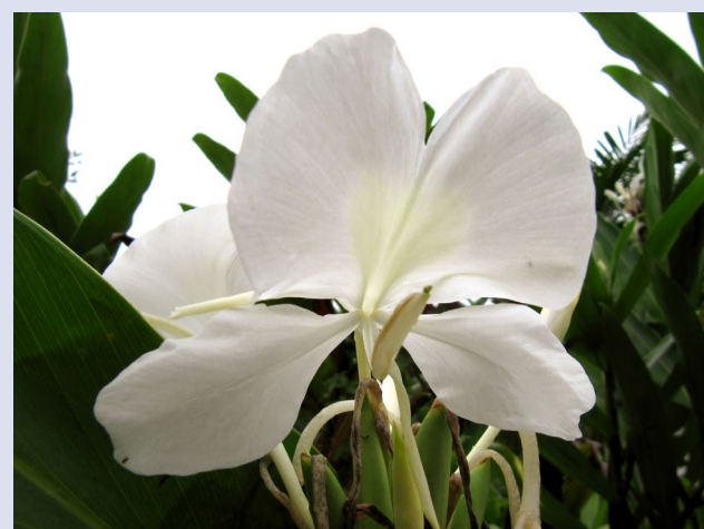
Figure 4: Flower of Hedychium coronarium J. König.

Fortunately, H. coronarium is cultivated in many tropical and subtropical countries as an ornamental garden plant and as a source for flower garlands and cut flowers. The essential oil of the flowers has a scent reminiscent of jasmine and is often incorporated in commercial cosmetic preparations such as perfumes, skin conditioners, and facial masks. The juice from the mature seeds is used as a hair and skin treatment by native Hawaiians. 100 Both the flowers and the rhizomes are consumed as vegetables in parts of south-eastern Asia. The dried stem