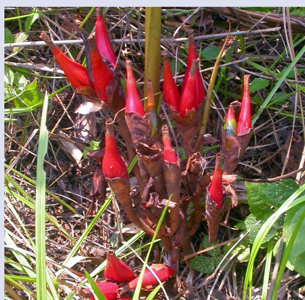
Figure 1: Seed pods of Aframomum melegueta (Roscoe) K. Schum. (from: https://images.app.goo.gl/7i3LE4owB5vwjDjX7 ).

A. melegueta has a long traditional medical use in Africa and Afro-American communities including those of the Surinamese Maroons where it is known as 'nengrekondre pepre' ('pepper from the homeland of the Africans'). Seed preparations are used, among others, against infections and inflammations of the respiratory tract and the gastrointestinal system; to repel pests of stored grains; to fight cancer; for treating infertility; and against hypertension and diabetes mellitus. 15,18,19 A hot-water infusion of the seeds would also help against stuttering when drunk from the larynx of a howler monkey or a large snail shell 12 , and an alcoholic extraction would serve as an aphrodisiac. 15 A. melegueta seeds are, furthermore, essential components of Maroon rituals and herbal baths to exorcise evil spirits and neutralize witchcraft, but also in practices to attract good fortune. 15