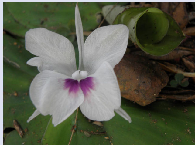
Figure 5: Flower of Kaempferia galanga (L.) willd..

The east-Indian galangal, sand ginger, aromatic ginger, or kentur Kaempferia galanga (L.) Willd. is a small, stemless herb that grows from a rhizomatous rootstock, and is characterized by the thick, rounded leaves that lay flat in a rosette on the ground. The plant develops beautiful