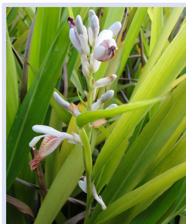
Figure 2: Flower of Alpinia galanga (L.) Willd. (from: https://images.app.goo.gl/XVNmeSWm7jxx6Ls8A ).

The Thai ginger, java galangal, greater galangal, or laos Alpinia galanga (L.) Willd is one of four plants known as galangals or blue gingers. It