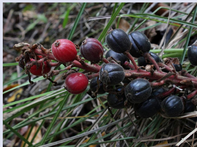
Figure 6: Fruits from Renealmia alpinia (Rottb.) Maas (from: https://images.app.goo.gl/qZF2bk1icRpYip3R8 ).

The inkplant, bigi masusa, or blaka masusa Renealmia alpinia (Rottb.) Maas, also known as Renealmia exaltata L. fil.), bears fruits that are red when immature and turn purple-black when mature (Figure 6), and then contain numerous seeds embedded in a yellow pulp. It grows from red, aromatic rhizomes and often forms large colonies. The vernacular name 'inkplant' reflects the previous use of the dark-colored sap of the