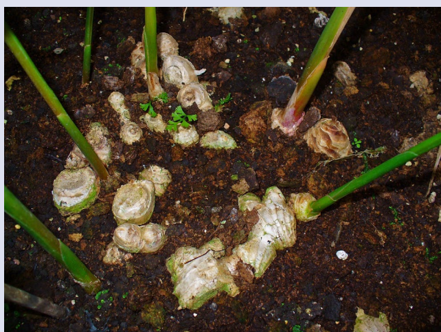
Figure 7: Rhizome of Zingiber officinale Roscoe.

The common ginger or dyindya Z. officinale probably originates from south-eastern Asia where it was presumably domesticated (it does not exist anymore in its wild state), and subsequently spread throughout the rest of the continent and many other parts of the world. It may have been introduced in Suriname by enslaved Africans and Javanese indentured laborers via Western Africa and south-eastern Asia, respectively. 10,14 The inflorescences directly arise from the rhizome on separate shoots (Figure 7) and bear clusters of white and pink flower buds that bloom into yellow flowers. Because of its esthetic appeal, the plant is often used