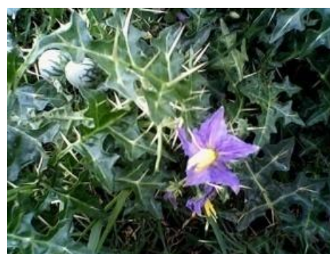
Solanum virginianum L.

A very prickly, diffuse herb, somewhat woody at the base; stem somewhat zigzag. Prickles compressed, straight, yellow, often exceeding 1.3 cm long. Leaves 5-10 cm long, ovate or elliptic, sinuate or subpinnatifid, obtuse or subacute, armed on the midrib and nerves with long yellow sharp prickles. Flowers in extra axillary few-flowered cymes; corolla purple, 2 cm long. Berry 1.3-2 cm diam., yellow or white with green veins, surrounded by the enlarged calyx. Roots are diuretic and expectorant; employed in cough, asthma, chest pain and catarrhal fever. Fruit juice is useful in sore throat and rheumatism. Stem, flowers and fruits are carminative. Paste of the leaves is applied on painful joints to relieve pains. Seeds are given as an expectorant in asthma and cough. Decoction of the plant is useful in gonorrhoea. The plant also possesses cardioactive and antipyretic activities. Crude plant extract caused hypotension which has been attributed to release of histamine by some constituents.