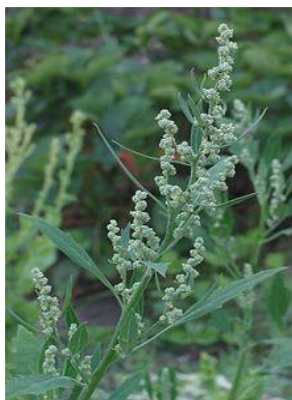
Chenopodium album L

It tends to grow upright at first, reaching heights of 10–150 cm (rarely to 3 m), but typically becomes recumbent after flowering (due to the weight of the foliage and seeds) unless supported by other plants. The leaves are alternate and can be varied in appearance. The first leaves, near the base of the plant, are toothed and roughly diamond-shaped, 3–7 cm long and 3–6 cm broad. The leaves of Chenopodium album known as bathua sag in Hindi, pigweed in English and are distributed throughout world. About 21 species occur in India (Kirtikar and Basu, 1965) [20], particularly in Western Rajasthan, Kulu valley and Shimla (Deenanath et al. , 2009) [8]. This plant is a polymorphous, mealy white, erect herb, up to 3.5m in height, and found wild in altitude of 4,700 metres. It is reputed to be a medicinal plant in scientific and folkloric literature and its medicinal values are well documented. It has been found to have antipruritic, antinociceptic (Dai et al. , 2002) [7], sperm immobilizing activity (Shrabanti et al. , 2007) [25]. Medicinally, this plant has been used to treat various symptoms attributable to nutritional deficiencies.