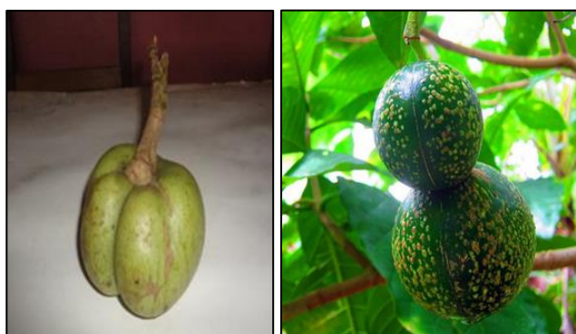
Fig 1: Fruits of T. contorta (left) and V. africana (right)

The plant material used consisted of the ripe fruits of Tabernaemontana contorta and Voacanga africana (Figure 1) who have been collected at Mount Eloudem (Nkolbisson – Yaounde) and identified in the National Herbarium of Cameroon under reference numbers 26138/SFR/Cam and 9227/SFR/Cam respectively between January and February 2020. The fruits of these harvested plants have been washed, cut and, then dried at room temperature in the dark to preserve as much as possible the integrity of the molecules. They were then reduced to powder (800 µm to 1600 µm), and packed in poly bags and stored at 4°C for laboratory works. The extract preparation, fractionation, and chemical screening were performed in the Laboratory of Chemistry of Université des Montagnes (UdM), and the antibacterial potential tests conducted in the Laboratory of Microbiology of the Université des Montagnes (UdM) teaching hospital in Banekane (West-Cameroon).