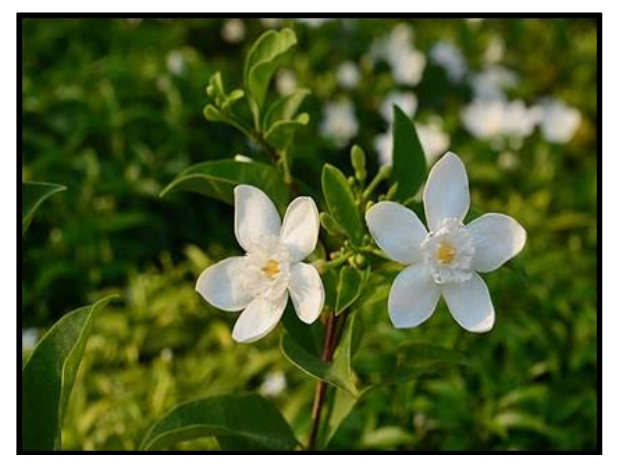
Fig 1: Plant profile of Wrightia tinctoria

Lamina: Epidermal cells of the lamina are square shaped with outer convex wall and thin cuticle.