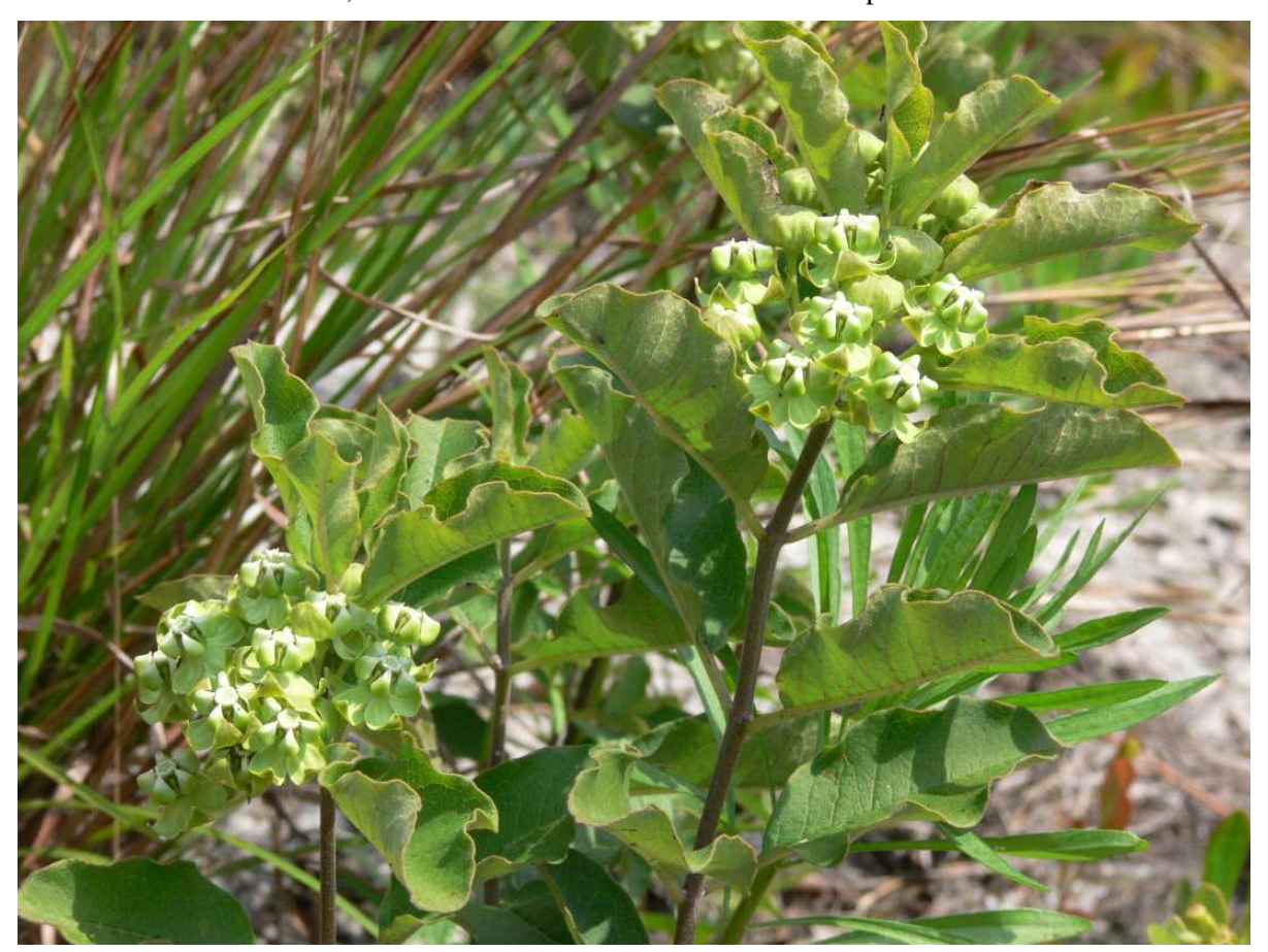
Figure 1. Asclepias tomentosa. Hoke Co., North Carolina.