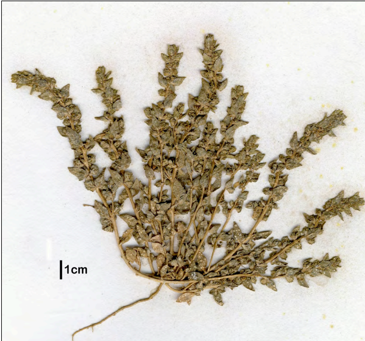
Figure 2. Dried specimen of Atriplex flavida (Taylor 9499, to be distributed). White balance in image was adjusted to neutrality to show the subtle, characteristic yellow color cast.

Comparison with Atriplex coronata . Atriplex flavida and A. coronata (Fig. 1A) are both annuals with small, entire, sessile or proximally short-petioled leaves. Herbage in both is densely scurfy, but the overall color of A. flavida is yellow-green whereas that of A. coronata is gray-green (Fig. 1A) making it easy to distinguish the species where sympatric (except perhaps for very young plants). Staminate and pistillate flowers in both species are mixed in small axillary glomerules. Staminate flowers of A. flavida are 3(4)-merous whereas those of A. coronata are (4)5-merous. Fruiting bracteoles of A. flavida are 2.8–3.8 mm long, 2.6–3.2 mm wide, obovate to obovate-deltoid in profile, broadly cuneate at base, smooth to more or less prominently tuberculate on both surfaces. The middle tooth of the distal margin generally is more prominent than the other teeth (Fig. 3). Fruiting bracteoles of A. coronata vary between varieties but are 2–6 mm long, 3–7 mm wide, broadly cuneate to semicircular in profile, broadly obtuse to truncate at base, with sides smooth or obscurely to prominently tuberculate. The middle tooth of the distal margin generally is not larger than the other teeth. Fruiting bracteoles of var. coronata , with which A. flavida co-occurs, are semicircular, (2)3–5 mm long, 3–7 mm wide, and broadly cuneate to truncate at base. Var. vallicola is characterized by fruiting bracteoles 2–2.5 mm long.