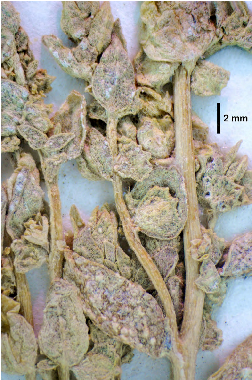
Figure. 3. Detail of Atriplex flavida specimen (Taylor 9499, to be distributed). White balance in image was adjusted to neutrality to show the subtle, characteristic yellow color cast.