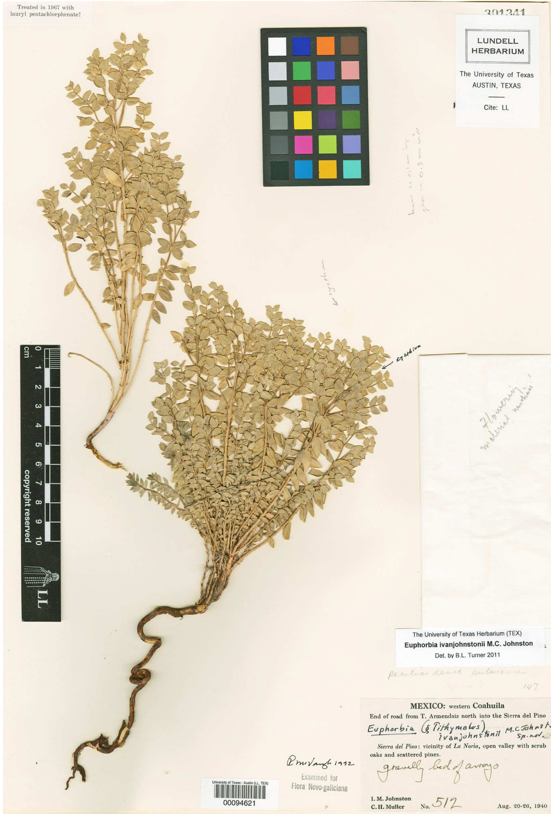
Figure 3. Euphorbia ivanjohnstonii (typical form).