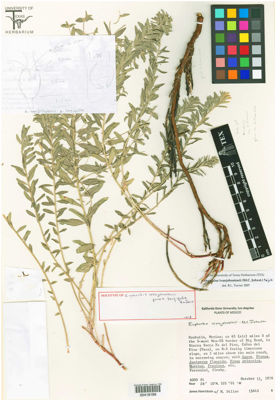
Figure 2. Euphorbia ivanjohnstonii forma longifolia (holotype: TEX).