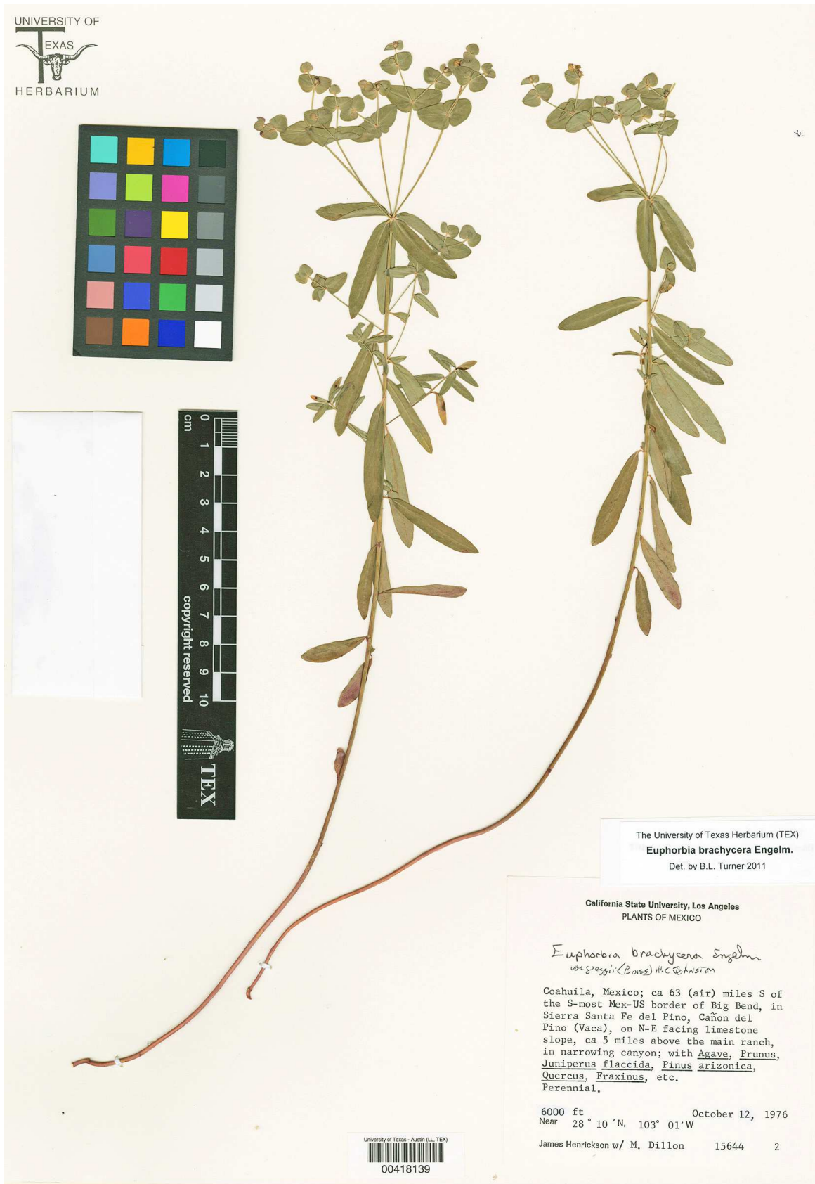
Figure 4. Euphorbia brachycera (growing with E. ivanjohnstonii forma longifolia ).