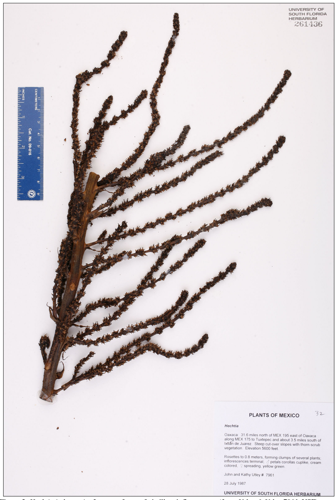
Figure 3. Hechtia ixtlanensis. Isotype of part of pistillate inflorescence (from Utley & Utley 7961, USF).