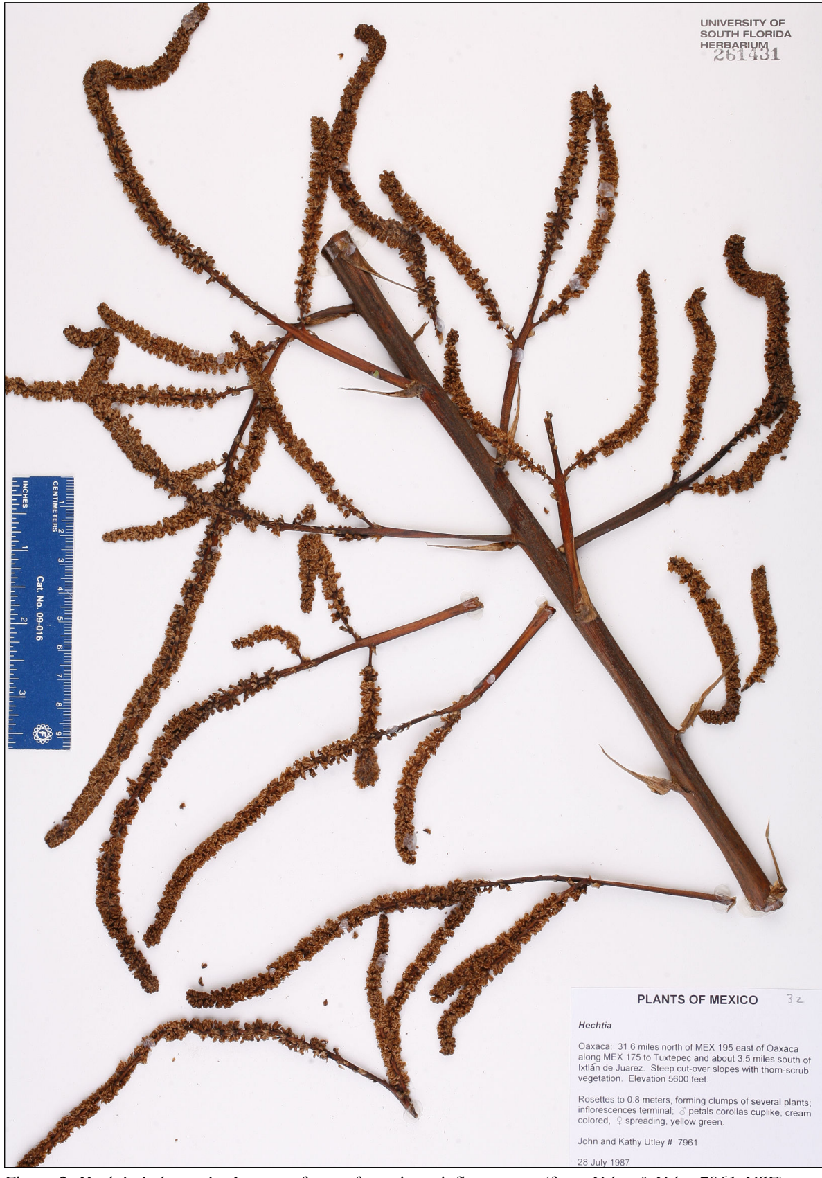
Figure 2. Hechtia ixtlanensis. Isotype of part of staminate inflorescence (from Utley & Utley 7961, USF).