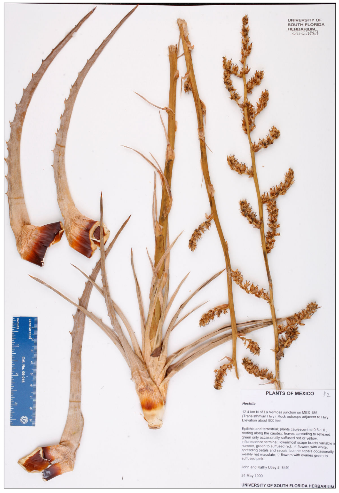
Figure 8. Hechtia isthmusiana. Isotype of pistillate plant (from Utley & Utley 8491, USF).