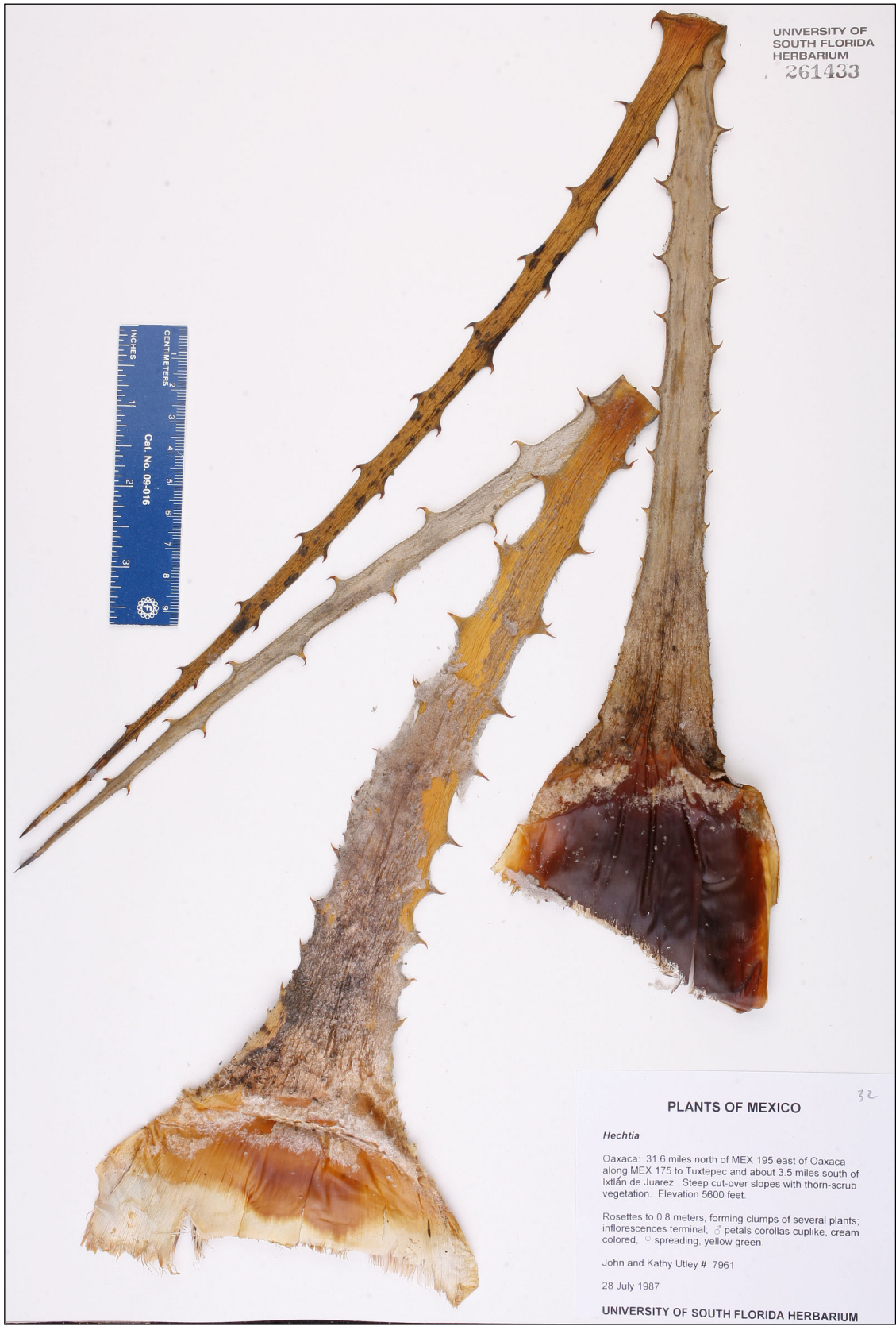
Figure 1. Hechtia ixtlanensis. Isotype of leaves (from Utley & Utley 7961, USF).