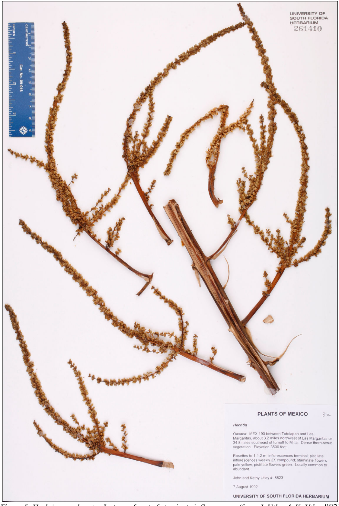
Figure 5. Hechtia complanata. Isotype of part of staminate inflorescence (from J. Utley & K. Utley 8823, USF).