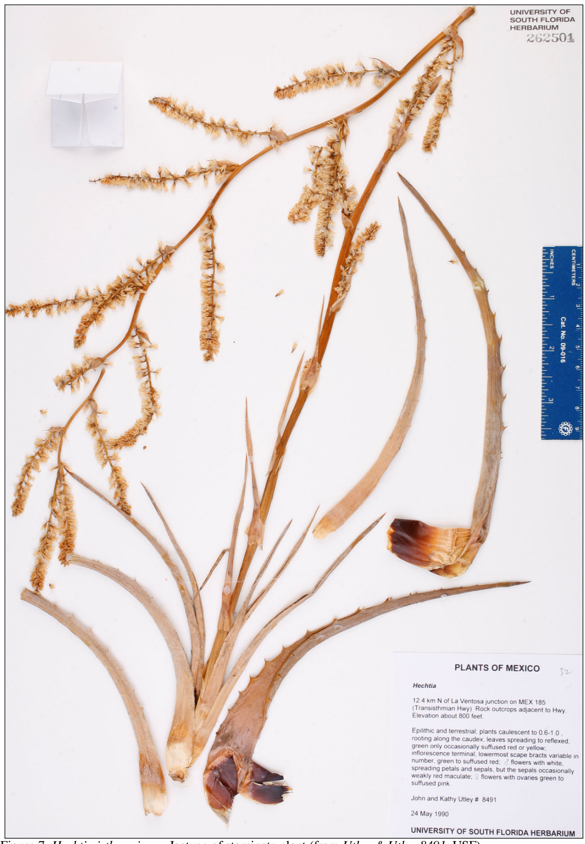
Figure 7. Hechtia isthmusiana. Isotype of staminate plant (from Utley & Utley 8491, USF).