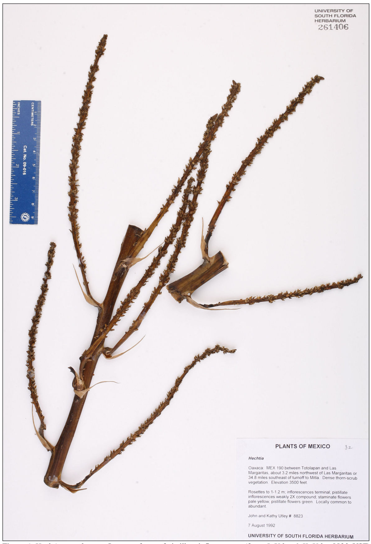
Figure 6. Hechtia complanata. Isotype of part of pistillate inflorescence (from J. Utley & K. Utley 8823, USF).