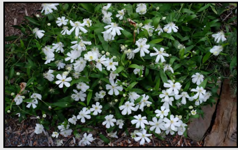
Clematis hexapetala 'Mongolian Snowflakes'

Our 2'- wide Clematis hexapetala 'Mongolian Snowflakes' has excelled in limestone—outperforming itself in compost-based garden locations. We've enjoyed an all-summer flurry of starry white four-petaled flowers.