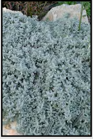
Teucrium polium ssp. aureum 'Mrs. Milstead'

Two years after the first crevices were populated, we've been amazed at how rapid and deep plants have rooted in and grown in our dry, coarse mix.