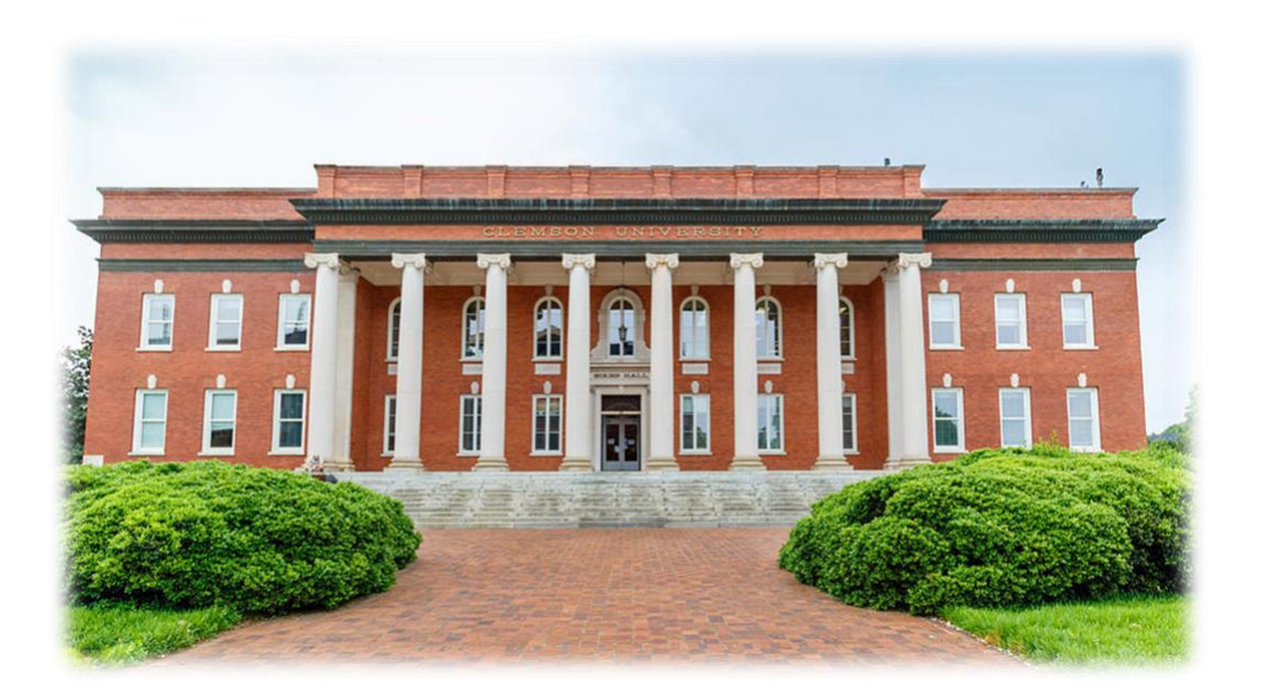
Clemson highlights 9: Sikes Hall, Administrative Building, Clemson University