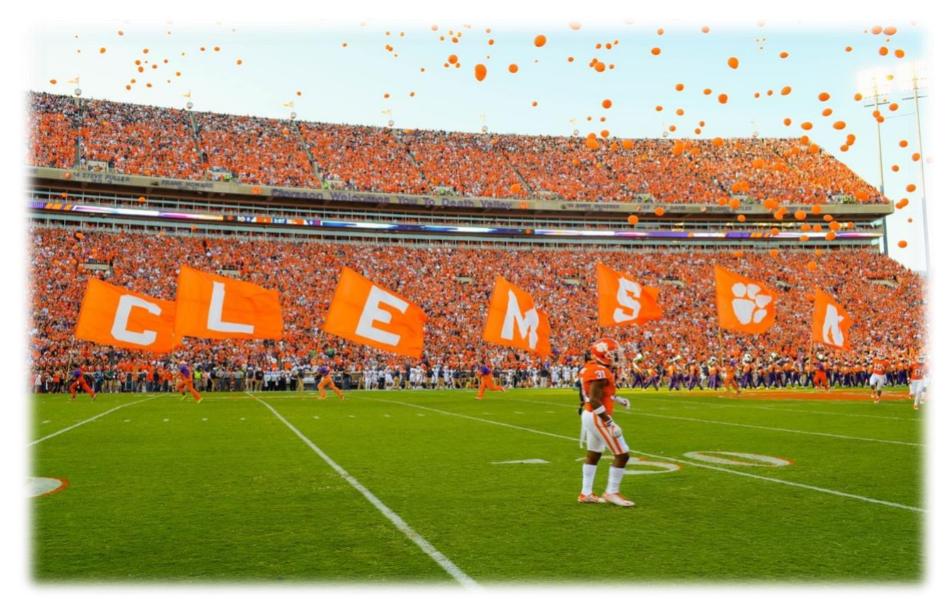
Clemson highlights 12: Celebrating Clemson football at Death Valley (Memorial stadium)

Vanilla is the most popular flavor in the world and the second spice with highest revenue. The natural vanilla industry is expected to reach 4.3 billion dollars by 2025 and the biggest importer of natural vanilla is the USA. Only 3 species and one hybrid of vanilloid orchids are used to produce natural vanilla: Vanilla planifolia, Vanila odorata, Vanilla pompona and Vanilla x tahitensis. From a market perspective vanillin is the most important metabolite of the natural vanilla extract. One of the principal breeding objectives around vanilla plants is to increase the vanillin concentration in the vanilla cured pods. The vanillin biosynthesis pathway has not been completely understood and at least three possible alternatives are considered. This study uses a comparative transcriptomic approach to propose candidate genes affecting vanilla (Vanilla planifolia Jacks. ex Andrews) pod vanillin accumulation. We compared RNA counts for two accessions (with contrasting vanillin content), as well as three time points (months 6, 7 and 8 after pollination) and two tissue types (outer epicarp and inner placental and seed tissue). The gene calls found in this project may also shed light on the proposed vanillin pathways as part of a redundant metabolic process. Negative regulation genes are also proposed that may be decreasing vanillin accumulation through precursor sequestration or enzymatic competition in the vanillin synthesis machinery of the vanilla pods.