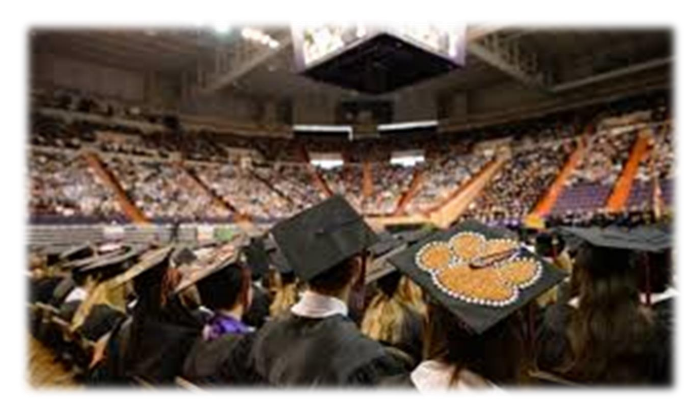
Clemson Highlights 10: Clemson University Graduation Ceremony (Little John Coliseum)

mapping Fon race 2 resistance QTLs. KASP markers were developed (N=51) for the major QTL on chromosome 9 and for minor QTLs on chromosomes 1, 6 and 8. An inter-specific F2:3 population was developed from resistance donor USVL246-FR2 (C. amarus) and a susceptible cultivar 'Sugarbaby' (Citrullus lanatus) to validate the utility of the markers for introgression of resistance from the crop wild relative into cultivated watermelon. While 45 KASP markers were polymorphic in the intraspecific C. amarus population, only 27 segregated in the interspecific validation population. Four of the polymorphic markers (two on chromosome 9 and one each on chromosomes 1 and 8) showed significant difference in separation of genotypes based on mean disease severity, but together explained only 16% of the phenotypic variance. Haplotype analysis was more effective at predicting mean disease severity of families than single markers. Families that inherited resistant parental alleles at three KASP marker loci on chromosomes 9 and 8 had 42% lower disease severity than families with susceptible parental alleles. The haplotype markers identified in this study will be valuable for development of Fon race 2 resistant watermelon cultivars.