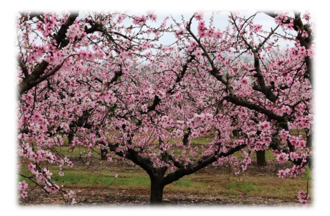
Clemson highlights 5: Peach bloom during the spring season at Musser Fruit Research Center.