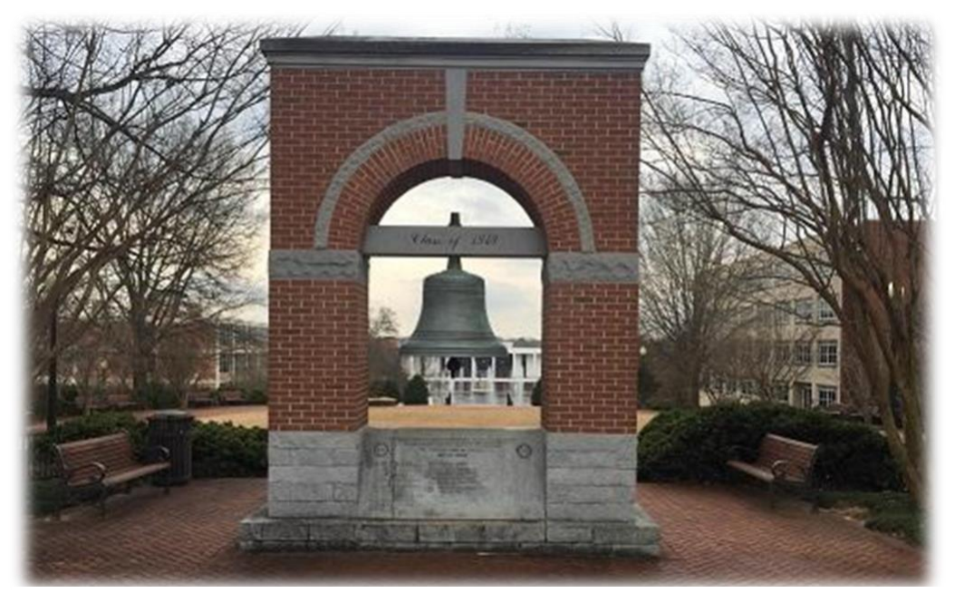
Clemson highlights 8: The Old Tillman Hall Bell at Clemson