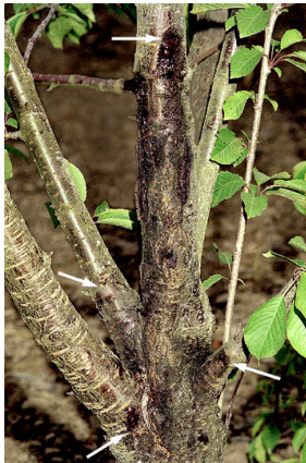
Figure 20. Sweet cherry with numerous cankers on limbs ( Pseudomonas syringae pv. syringae ).