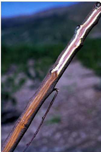
Figure 4. Brown, necrotic vascular tissues and gummosis of nectarine twig ( Pseudomonas syringae pv. persicae ).