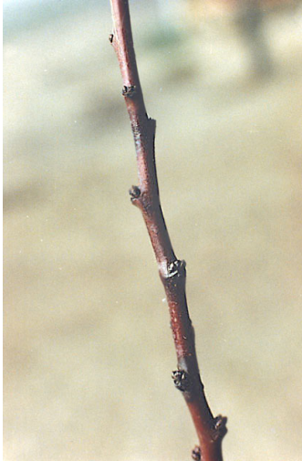
Figure 7. Peach with cankers on last year's growth, causing bud blight ( Pseudomonas syringae pv. persica ).