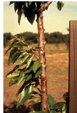
Figure 18. Cankers and bacterial ooze on young sweet cherry ( Pseudomonas syringae pv. syringae ).