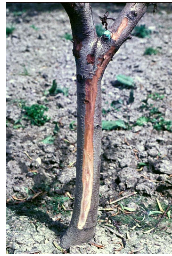
Figure 3. Extensive invasion of a nectarine trunk ( Pseudomonas syringae pv. persicae ).