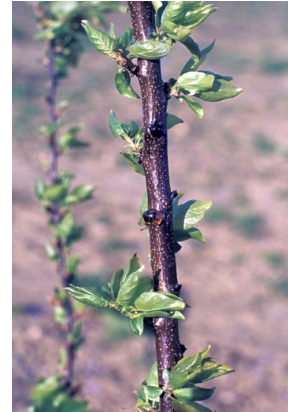
Figure 9. Droplets of bacterial ooze on young apricot ( Pseudomonas syringae pv. syringae ).