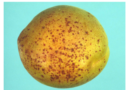
Figure 12. Numerous reddish necrotic spots on apricot fruit ( Pseudomonas syringae pv. syringae ).