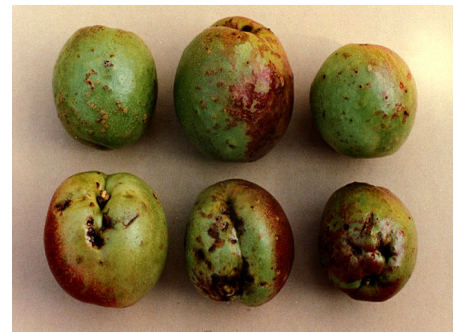
Figure 6. Various stages of lesion development on nectarine fruit ( Pseudomonas syringae pv. persicae ).