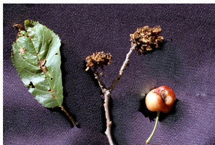
Figure 14. Blast stage on leaf, buds, and fruit of sweet cherry ( Pseudomonas syringae pv. syringae ).