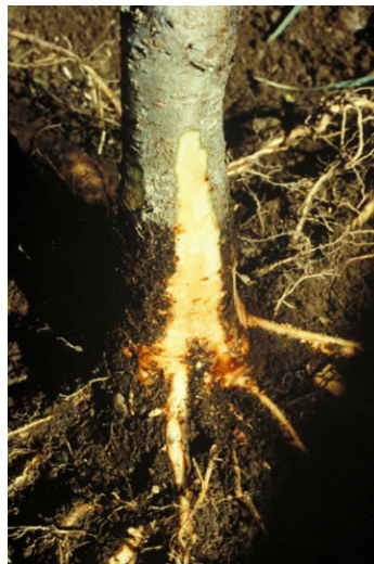
Figure 5. Diseased crown and roots of nectarine tree ( Pseudomonas syringae pv. persicae ).