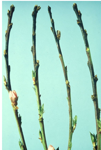
Figure 2. Nectarine twigs with infected spurs ( Pseudomonas syringae pv. persicae ).