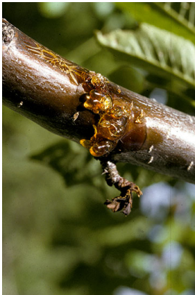
Figure 19. Gummosis on cherry twig ( Pseudomonas syringae pv. syringae ).