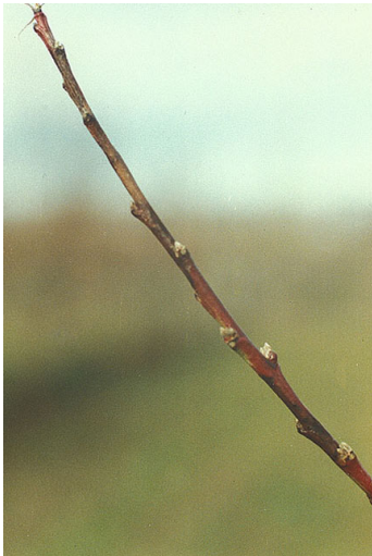
Figure 1. Nectarine with dark cankers on last year's growth ( Pseudomonas syringae pv. persicae).