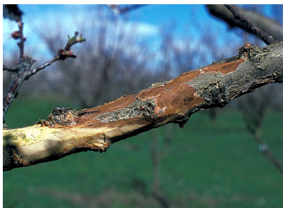
Figure 10. Brown, infected tissue and rough, cracked bark on apricot branch ( Pseudomonas syringae pv. syringae ).