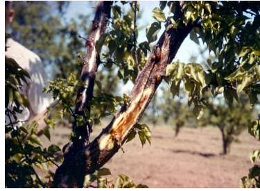
Figure 8. Canker symptoms on apricot branch ( Pseudomonas syringae pv. syringae ).