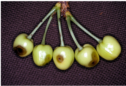
Figure 16. Sweet cherry exhibiting blast stage on young fruit. Note sunken centers of the lesions with water-soaked brown margins ( Pseudomonas syringae pv. syringae ).