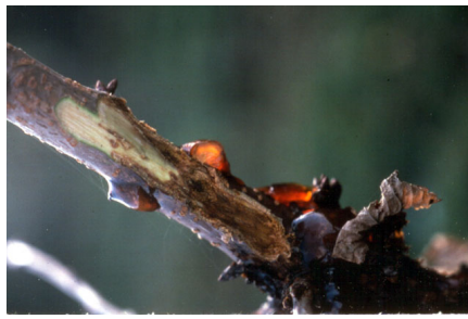
Figure 17. Cherry with internal systemic symptoms and bacterial ooze ( Pseudomonas syringae pv. morsprunorum ).