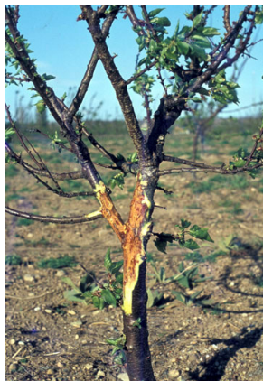
Figure 11. Apricot with sparse or no foliage on twigs. Canker symptoms are seen on exposed wood ( Pseudomonas syringae pv. syringae ).