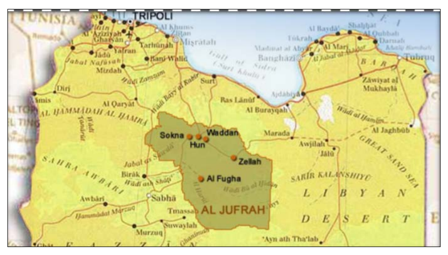
Fig 1: A map of Libya showing the study area (Al-Jufra). (https.www.libyaobserver.ly).

Journal of Medicinal Plants Studies http://www.plantsjournal.com