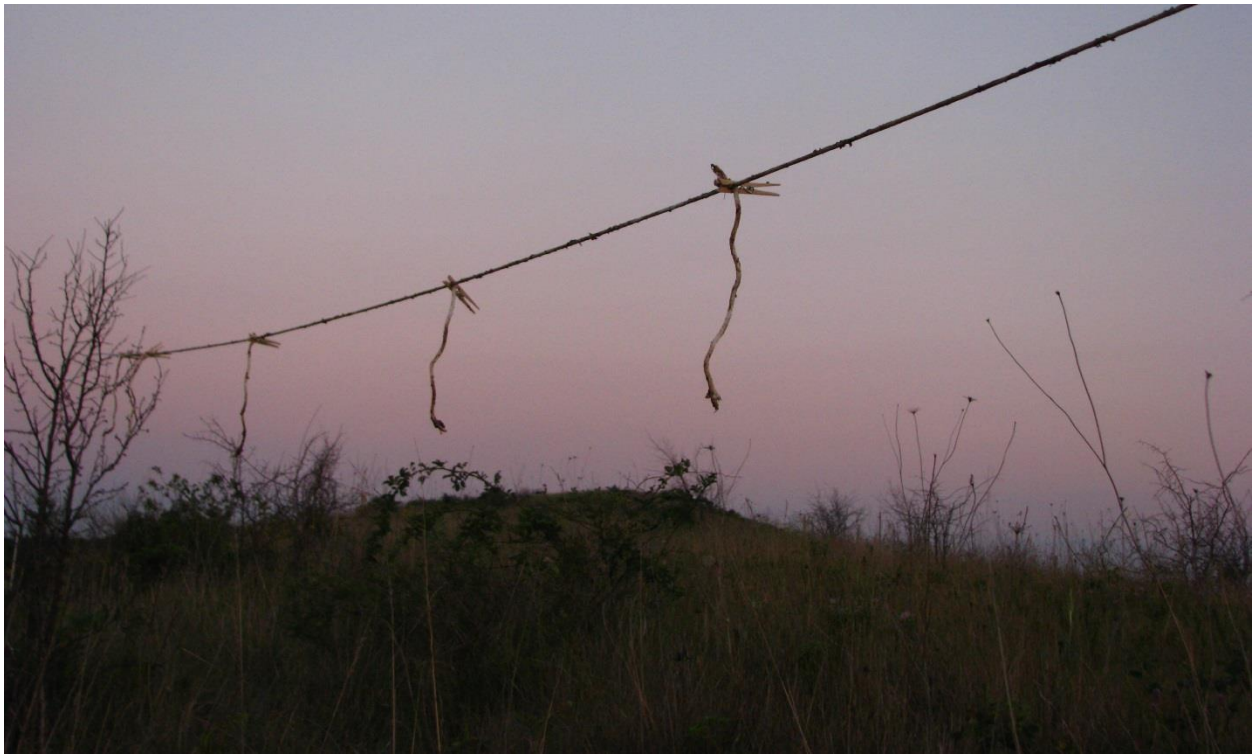
Figure 13. Rope and rope strips soaked in rotten banana-brown sugar bait at the Hogback Prairie (10 July 2012). Bait is normally pasted on tree trunks and shrubs (Figures 48, 49, 54, 56) but in open habitats rope can expand baiting potential.