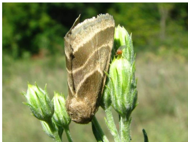
Figure 51. Schinia grandimedia Abraham's Woods Prairie (6 August 2012)