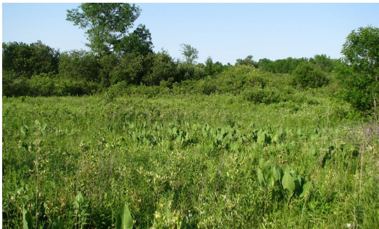
Figure 3. Root River Parkway, Milwaukee County (July 1, 2012).