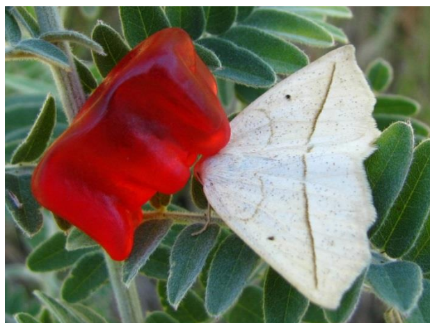
Figure 55. Eusarca confusaria conversing with gummy bear Abraham's Woods Prairie (26 June 2012)