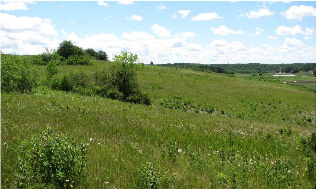
Figure 7. Mueller Prairie, Iowa County (June 21, 2012).