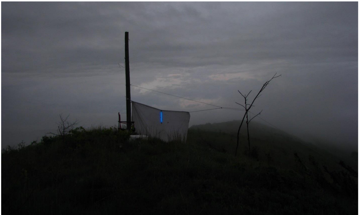
Figure 12. Blacklighting at the Hogback Prairie; setup requires more creativity in open habitats (28 May 2012).