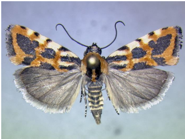
Figure 37. Spragueia leo Hogback Prairie 14 Aug 2012