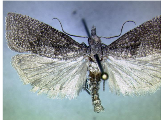
Figure 28. Eucosma nandana Root River Parkway 12 Sept 2012