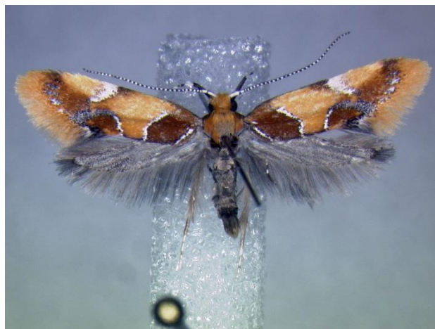
Figure 17. Epicallima argenticinctella Abraham's Woods Prairie 26 June 2012