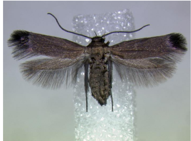
Figure 22. Scythris sp. Abraham's Woods Prairie 26 June 2012