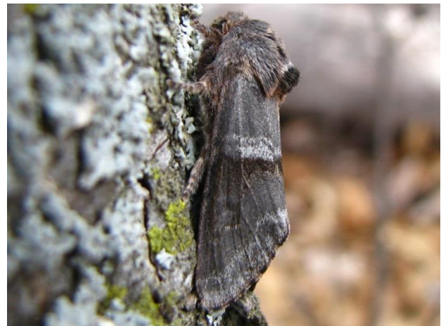
Figure 50. Psaphida grandis Hanson Prairies (8 April 2013)