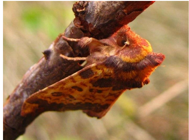
Figure 48. Papaipema cerina Abraham's Woods Prairie Abraham's Woods Prairie (16 September 2012)