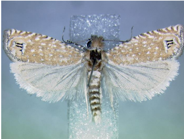
Figure 27. Eucosma albiguttana Lawrence Prairie 7 Aug 2012