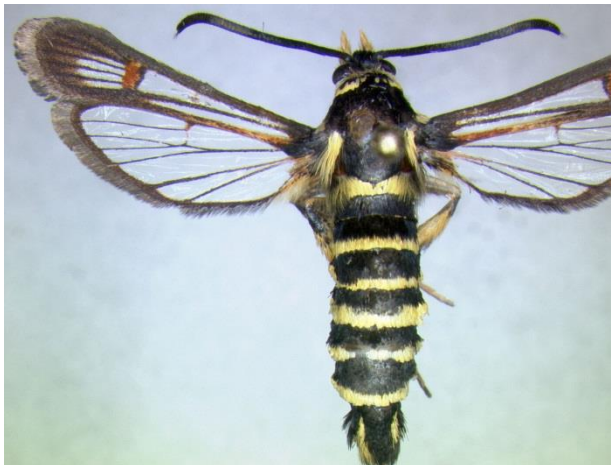
Figure 25. Synanthedon rileyana Hogback Prairie 10 July 2012