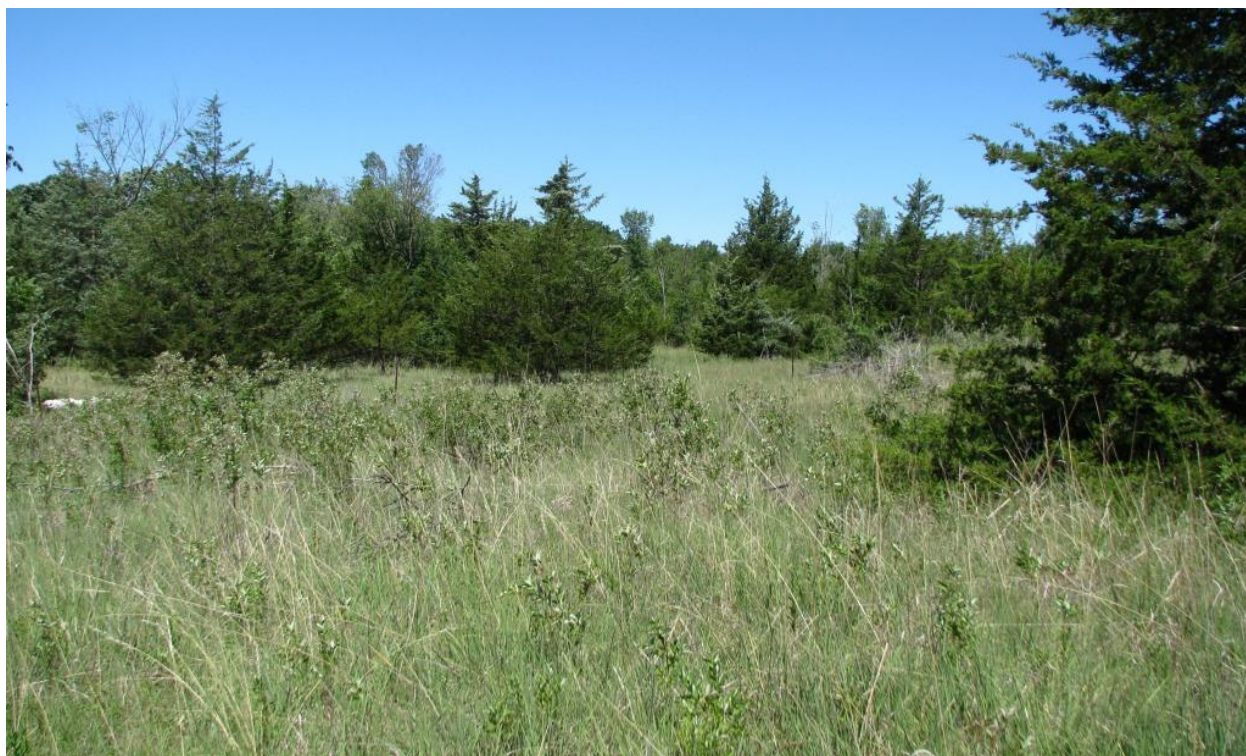
Figure 4. Lawrence Prairie, Rock County (June 25, 2012).