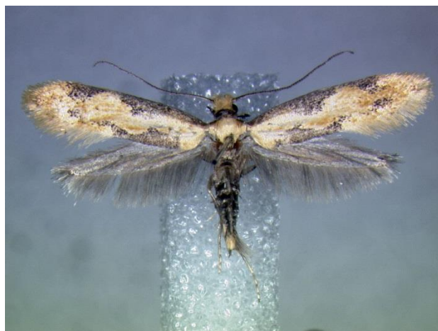
Figure 15. Hybroma servulella Abraham's Woods Prairie 26 June 2012