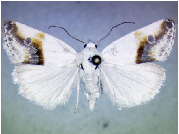
Figure 36. Ponometia binocula Hanson Prairies 9 July 2012