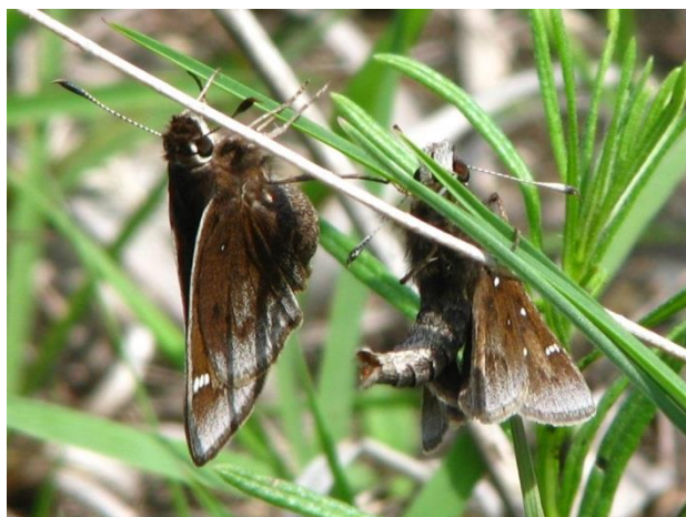
Figure 41. Atrytonopsis hianna (Dusted Skipper) courting pair Hogback Prairie (29 May 2013)