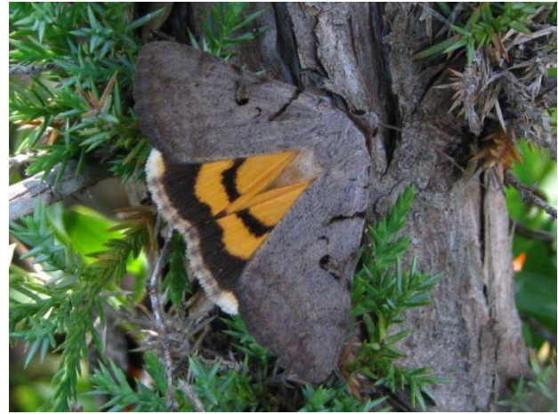
Figure 46. Catocala abbreviatella Stagecoach Prairie (22 June 2012)