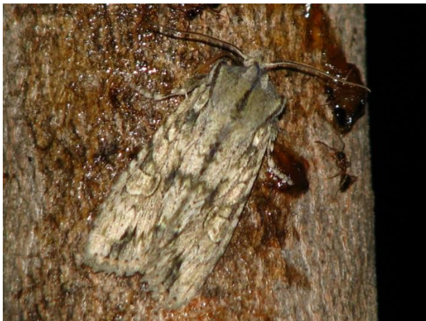
Figure 49. Lithophane sp. near disposita on baited tree trunk Abraham's Woods Prairie (16 September 2012)