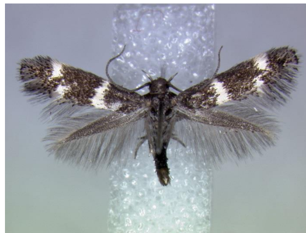
Figure 18. Elachista sp. Root River Parkway 8 Aug 2012