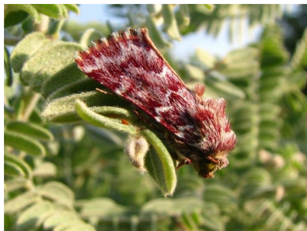
Figure 52. Schinia lucens (Leadplant Flower Moth) Stagecoach Prairie (22 June 2012)