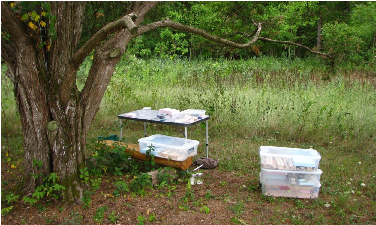
Figure 14. Many specimens were prepared directly in the field, here is a cozy setup at Lawrence Prairie (8 August 2012). Such methods allow for superior quality specimens which are more useable in certain DNA studies.