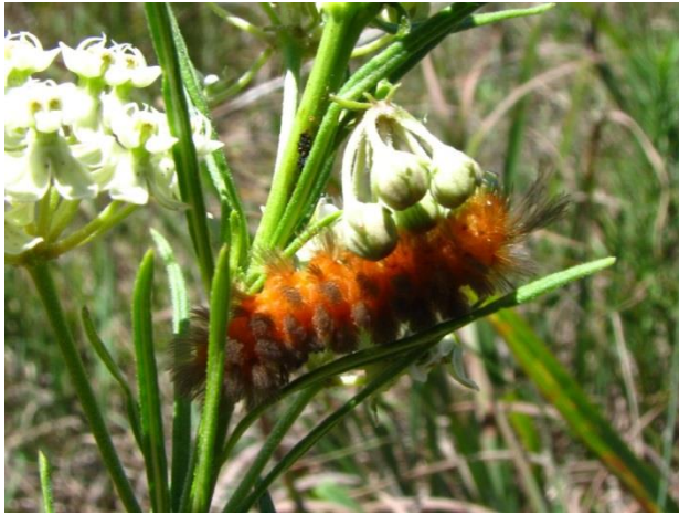
Figure 45. Cynia inopinatus larva on Asclepias verticillata Abraham's Woods Prairie (6 August 2012)