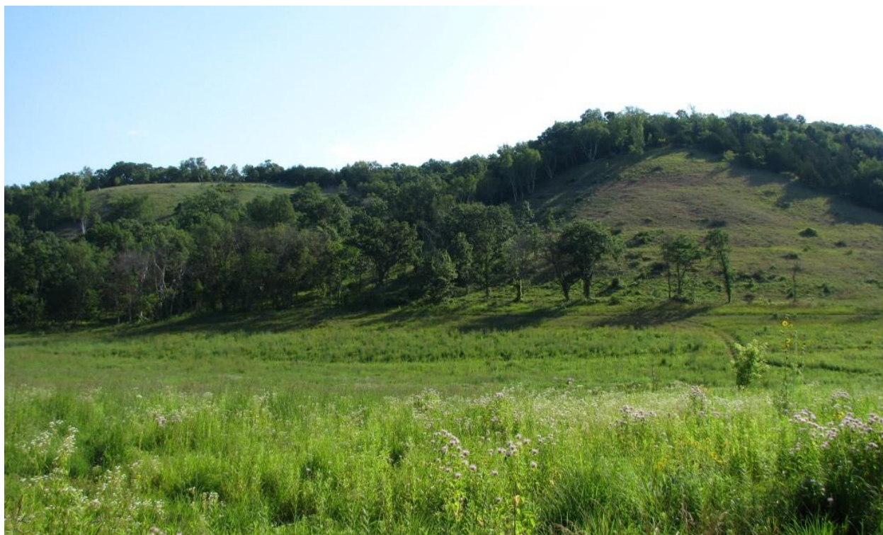
Figure 8. Doyle Road Prairies, Grant County (July 8, 2012).