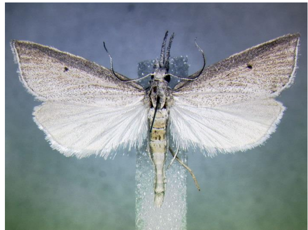
Figure 30. Eoreuma crawfordi Hanson Prairie 11 Aug 2012