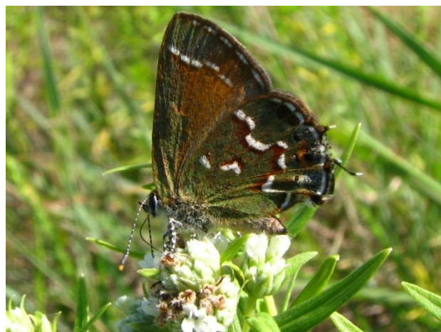
Figure 42. Callophrys gryneus (Juniper Hairstreak) Doyle Road Prairies (8 July 2012)