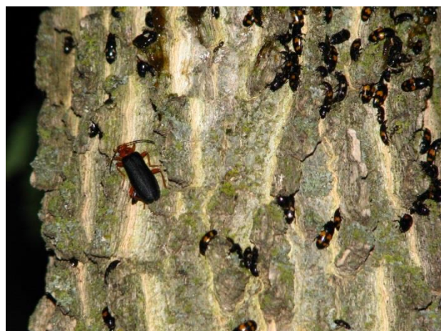
Figure 56. Nitidulid beetles and Neopyrochroa flabellata on bait Abraham's Woods Prairie (26 June 2012)