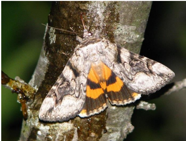
Figure 47. Catocala amestris on baited tree trunk Stagecoach Prairie (22 June 2012)