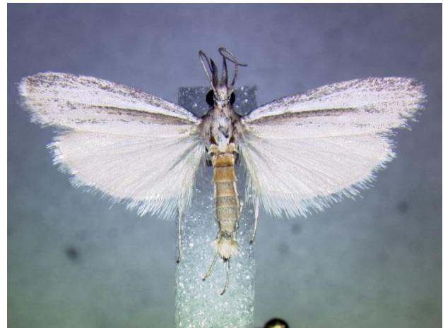
Figure 32. Peoria bipartitella Abraham's Woods Prairie 26 June 2012