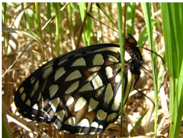
Figure 43. Speyeria idalia (Regal Fritillary) Mueller Prairie (21 June 2012)