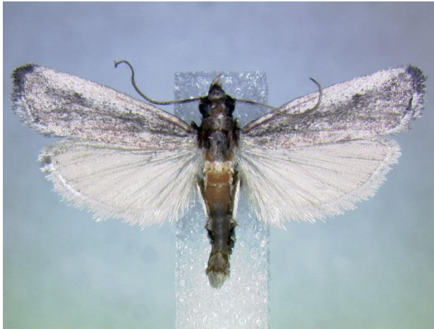
Figure 33. Atascosa glareosella Lawrence Prairie 7 Aug 2012