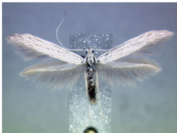
Figure 19. Coleophora sp. Root River Parkway 8 Aug 2012