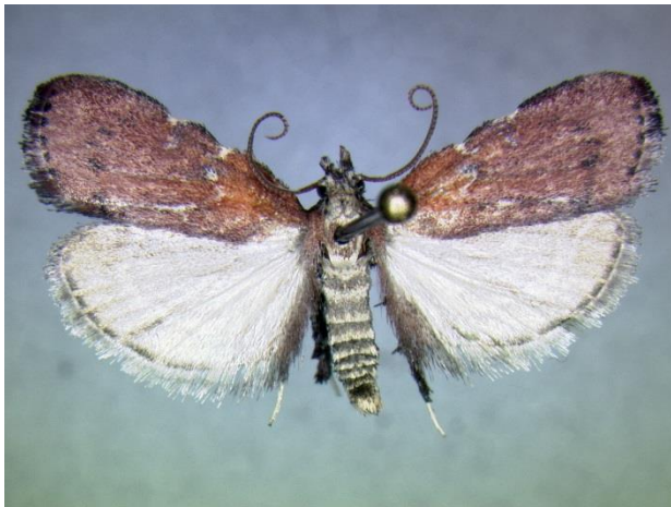
Figure 31. Galasa nigrinodis Abraham's Woods Prairie 26 June 2012