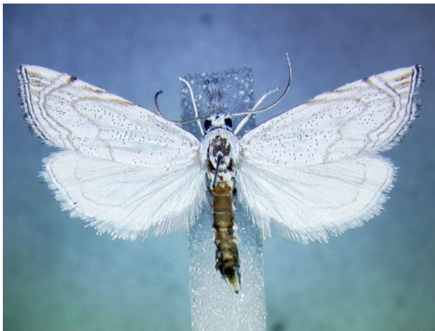
Figure 29. Haimbachia squamulella Lawrence Prairie 7 Aug 2012