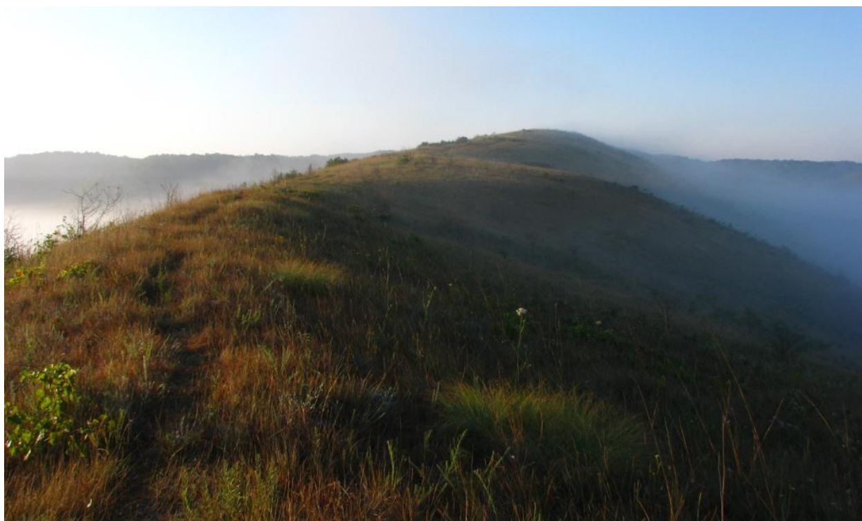
Figure 9. Hogback Prairie, Crawford County (July 11, 2012).