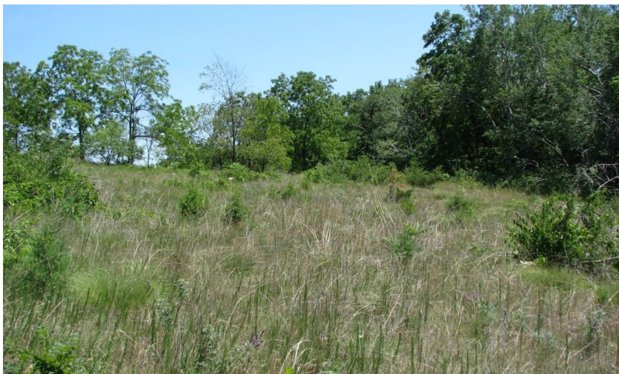
Figure 5. Abraham's Woods Prairie, Green County (June 26, 2012).