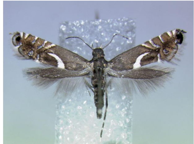
Figure 24. Diploschizia impigritella Lawrence Prairie 7 Aug 2012