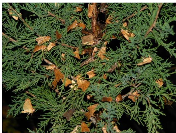
Figure 54. Moths swarming on banana-brown sugar bait Hanson Prairies (28 September 2012)