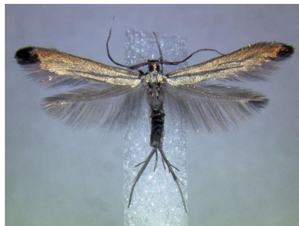
Figure 20. Coleophora sp. Root River Parkway 8 Aug 2012