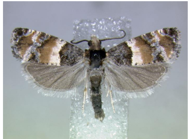
Figure 26. Lobesia bicinctana Root River Parkway 8 Aug 2012