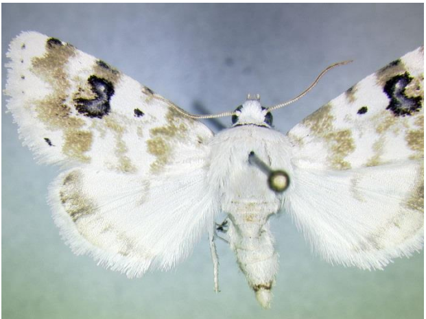
Figure 38. Schinia nundina Hanson Prairies 11 Aug 2012