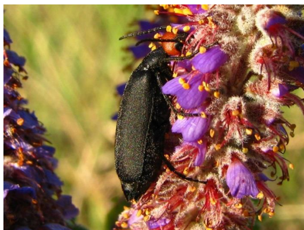
Figure 53. Epicauta atrata on Amorpha canescens flowers Abraham's Woods Prairie (26 June 2012)