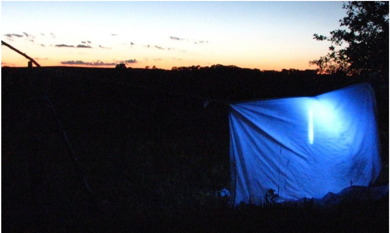
Figure 11. Blacklighting (UV sheet) at Mueller Prairie (21 June 2012).