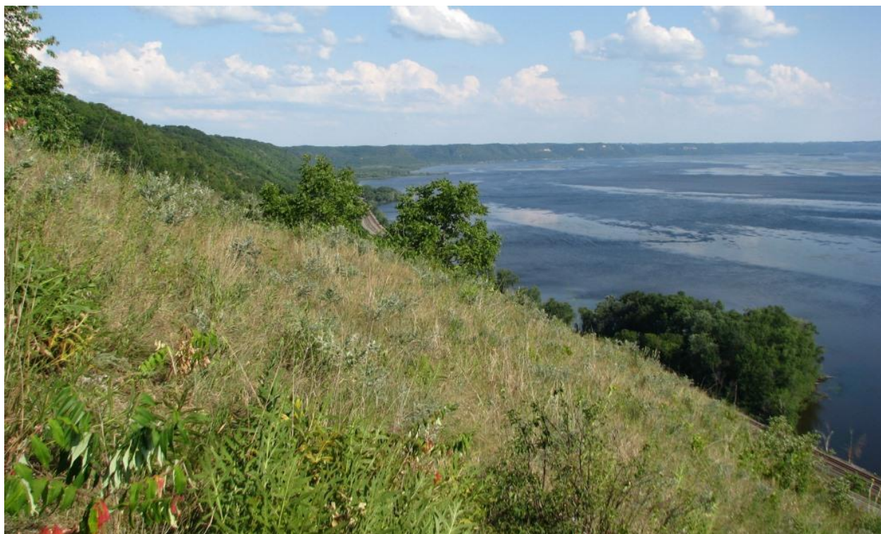
Figure 10. Hanson Prairies, Crawford County (July 9, 2012).