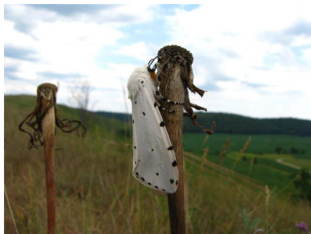
Figure 44. Estigmene acrea Hogback Prairie (10 July 2012)