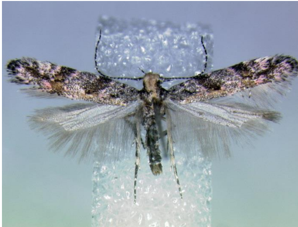
Figure 23. Aristotelia rubidella Lawrence Prairie 7 Aug 2012