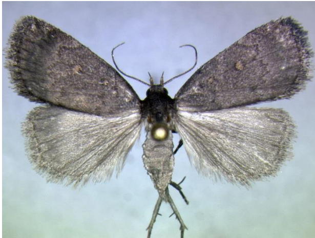
Figure 35. Idia diminuendis Hanson Prairies 9 July 2012