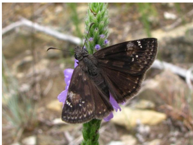
Figure 39. Erynnis lucilius (Columbine Duskywing) Doyle Road Prairies (8 July 2012)