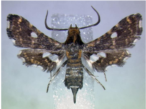
Figure 34. Thyris maculata Lawrence Prairie 8 Aug 2012