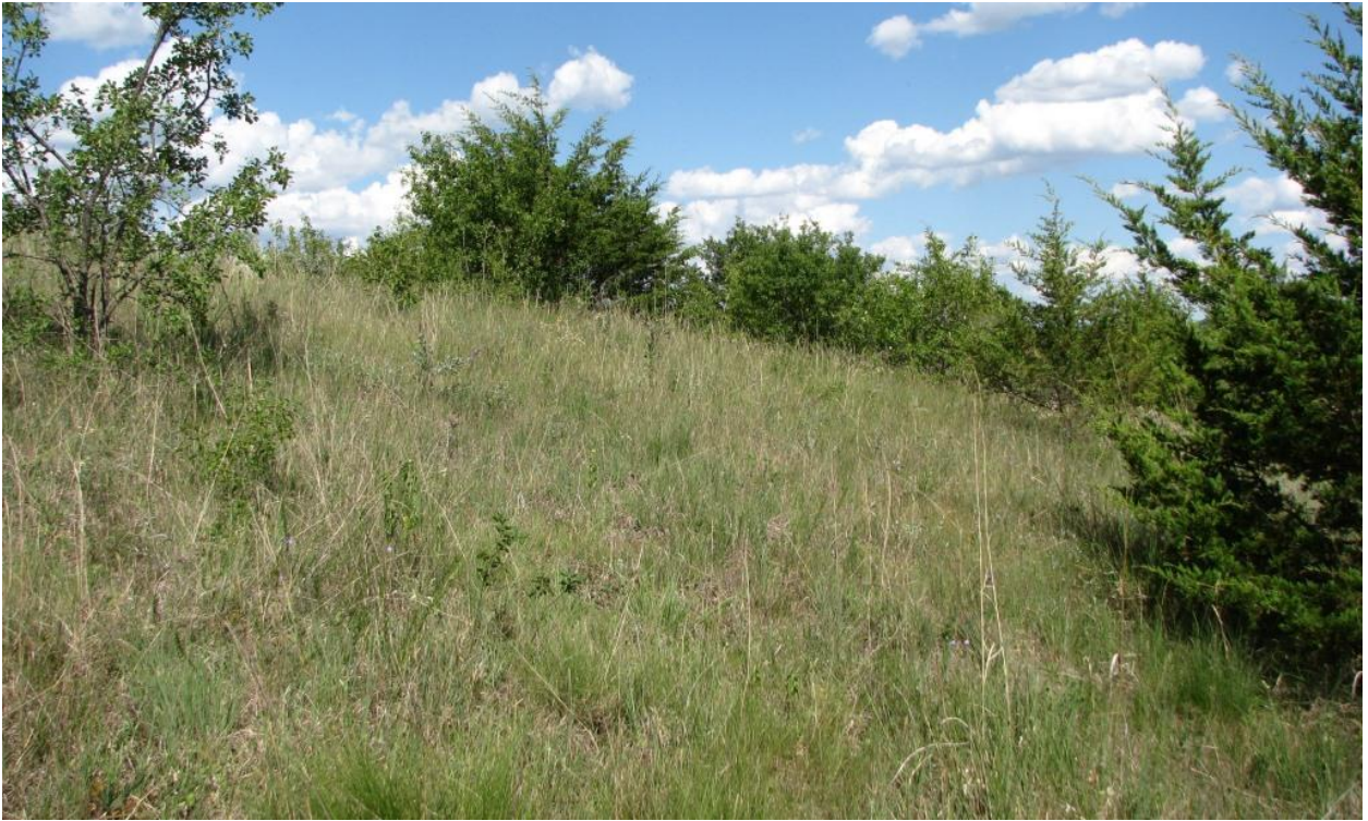
Figure 6. Stagecoach Prairie, Dane County (June 22, 2012).