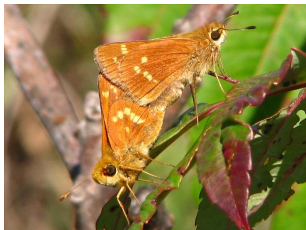
Figure 40. Hesperia leonardus (Leonards Skipper) mating pair Stagecoach Prairie (10 September 2012)