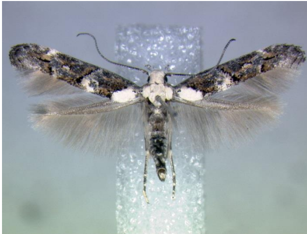
Figure 21. Mompha murfeldtella Root River Parkway 8 Aug 2012