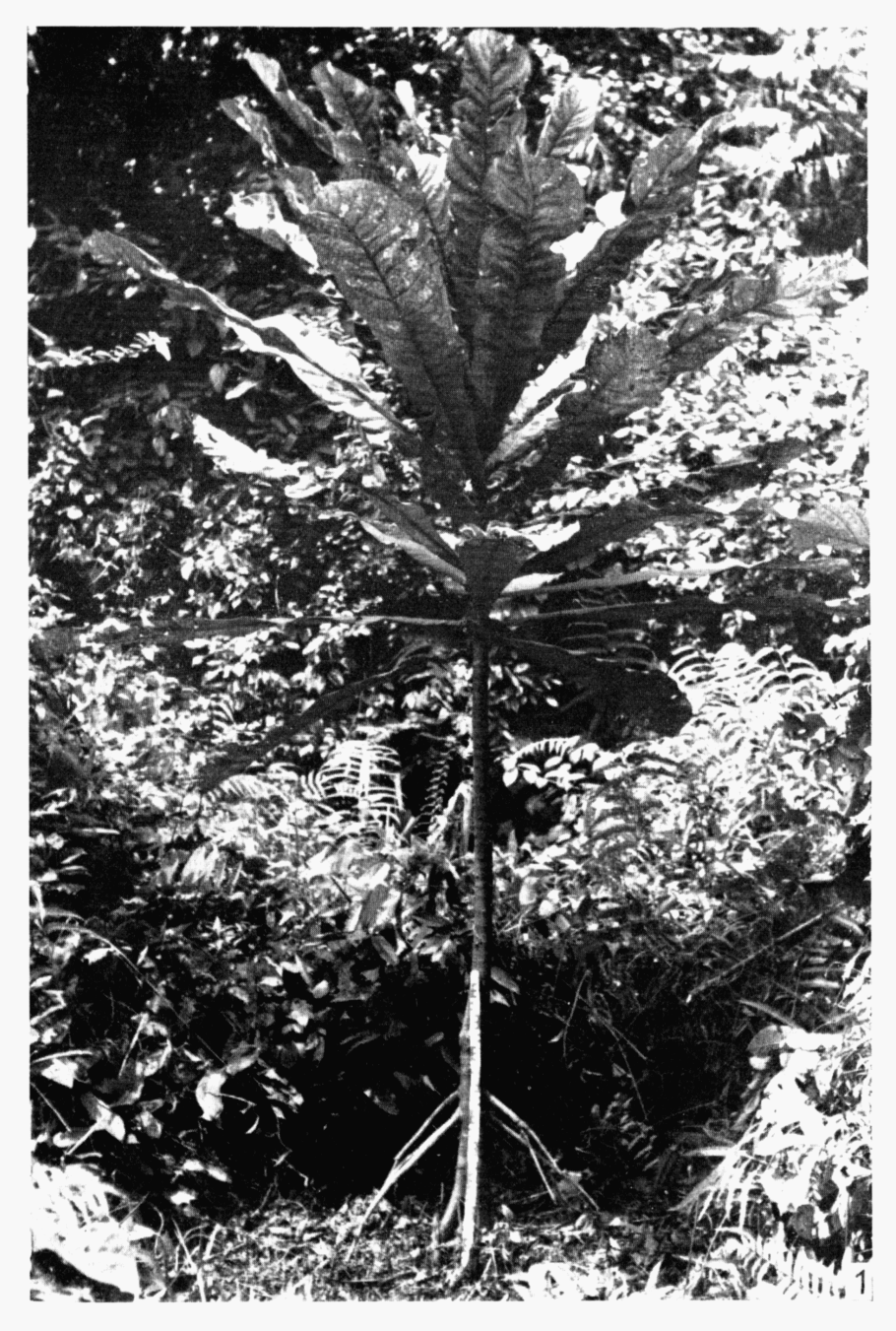
Photo 1. — General view of the growth habit of a young Anthocleista nobilis in a swamp in the Tano-Nimiri Forest Reserve, Ghana. The length of the scale at the foot of the tree equals 1 m. A detail of the peg-roots developed in the same tree is given on the Pl. X. : 3.