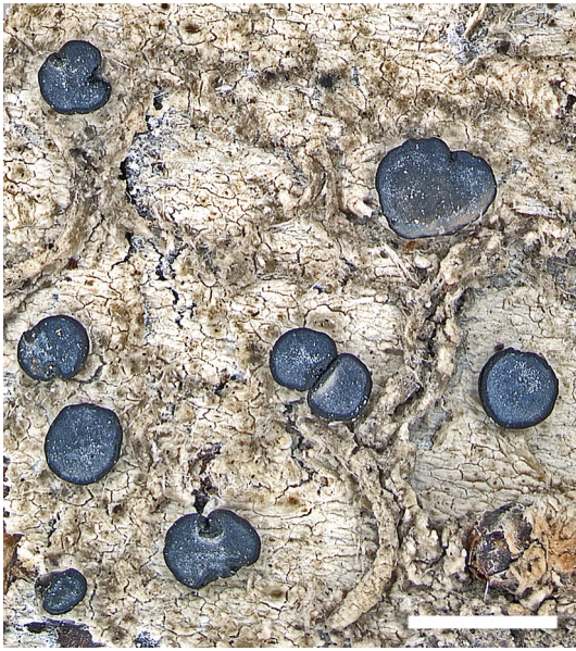
Figure 1. Tasmodella inactiva habit (holotype). Scale = 2 mm.

glance (without the aid of chemical analysis) has rarely posed a problem. Tasmodella inactiva has a pale greyish (rather than distinctly yellowish) thallus, its apothecial disc is commonly pruinose (but only rarely so in T. subfuscescens ) and also tends to be persistently plane and marginate (whereas in T. subfuscescens the disc frequently becomes convex and the margin is excluded (see Figs 1–2). This combination of chemical and morphological distinguishing characters make it worthy of species rank. The original description of T. inactiva was based solely on the differentiating chemical character. For completeness, a comprehensive morphological and anatomical description is provided here.