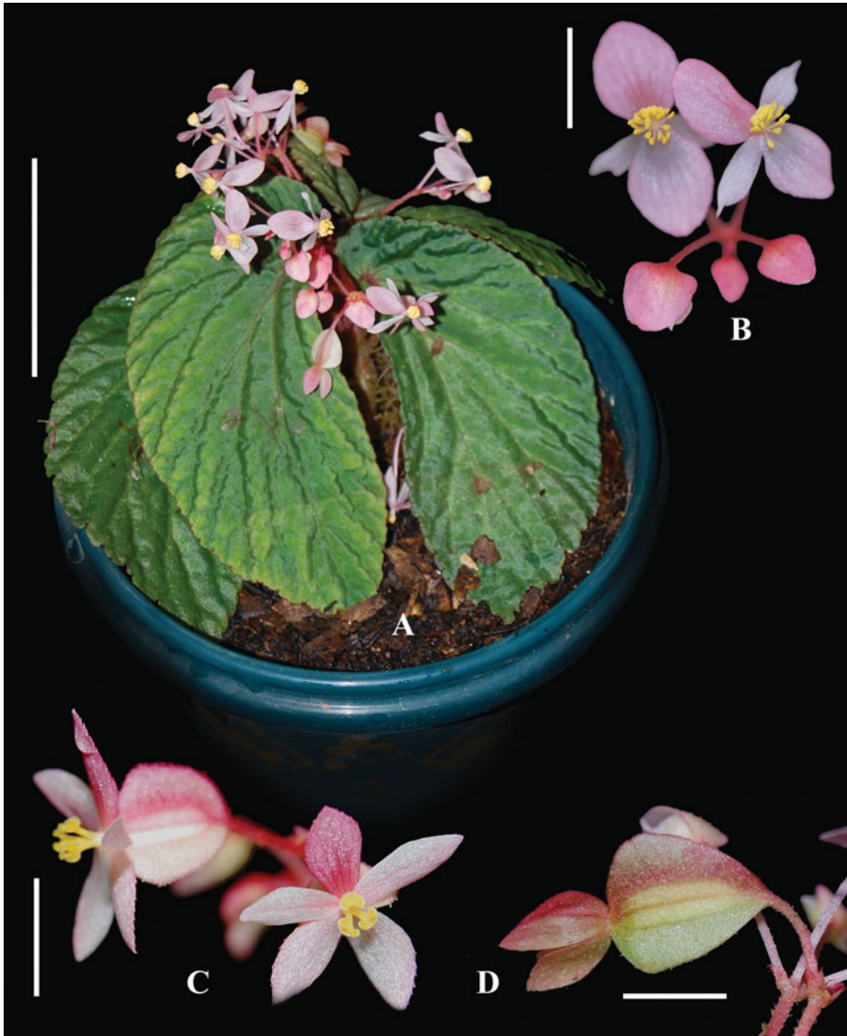
FIG. 1. Begonia curvifolia Ardi. A, Habit (scale bar, 5 cm); B, male flowers (scale bar, 1 cm); C, female flowers (scale bar, 1 cm); D, ovary with tepals (scale bar, 1 cm).

a dense indumentum of multicellular, red bristles. Stem few-branched; internodes 1.5–3 cm long, to c.6 mm in diameter, terete, greenish at the base and reddish at the apex. Leaves alternate; stipules persistent, 4–7 × 1.5–3 mm, triangular-ovate, prominent and hairy, apex filiform, margin ciliate, concolorous with the stem, semitranslucent at the margins; petioles c.0.5–4 cm long, shorter towards the apex, with